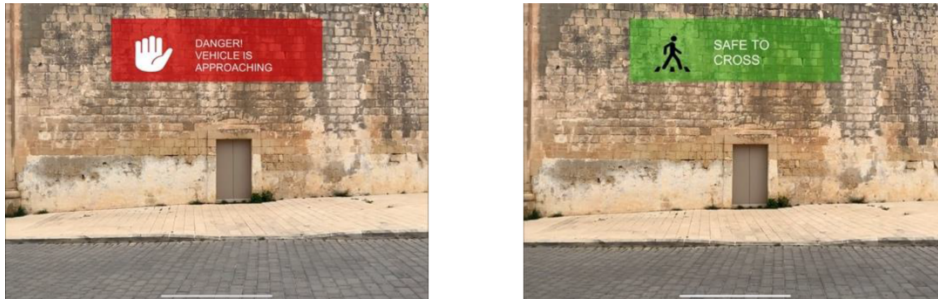
Figure 8: Concept 8. Left : the non-yielding state with the red HUD showing the hand icon and corresponding text message. Right : the yielding state with the green HUD, walking pedestrian icon, and corresponding text message.