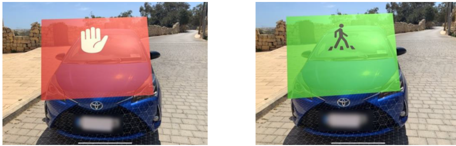
Figure 3: Concept 2. Left : non-yielding state with the red plane and hand icon augmented on the vehicle. Right : yielding state with the green plane and crossing figure icon augmented on the vehicle.