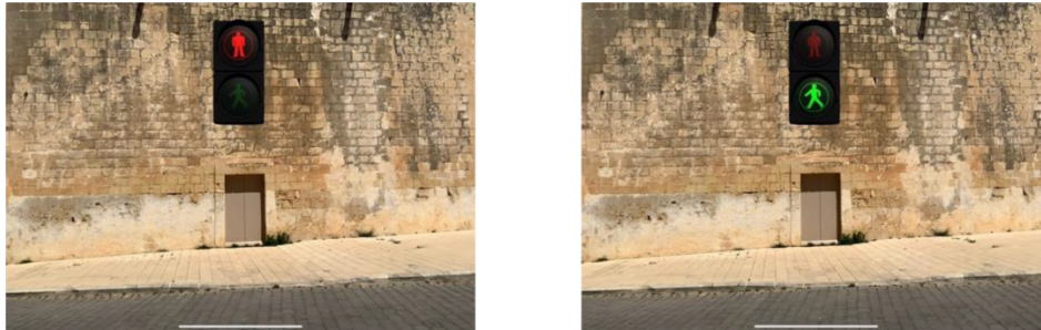
Figure 9: Concept 9. Left : non-yielding state with the red pedestrian icon. Right : yielding state with the green pedestrian icon.

head-locked text placement if the real-world task involves permanent visual monitoring in the central or near-peripheral visual field [26], which in our case would be monitoring of the vehicle. Moreover, the HUD was placed in the centre top section of the FOV since it is recommended to place text in top positions in complex environments that require constant monitoring [26]. Top positioning would also leave the bottom part of the FOV not occluded so that the pedestrian could still see where they are walking.