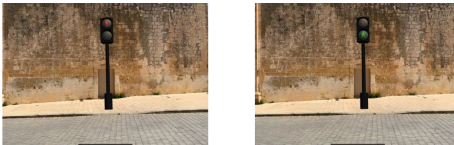
Figure 5: Concept 5. Left : non-yielding state with red pedestrian icon. Right : yielding state with green pedestrian icon.

field extends beyond the crossing point, whereas for the yielding state, the field switches to green, widens, and terminates prior to the point of crossing to emphasize the vehicle will not cross beyond this point.