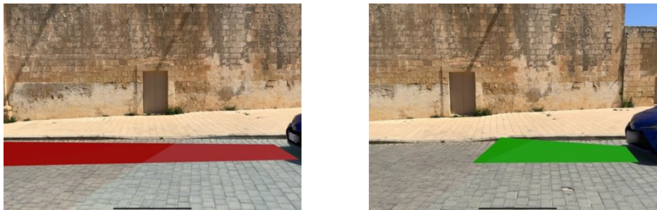
Figure 4: Concept 4. Left : non-yielding state with the red field of safe travel extending over the crossing area. Right : yielding state with the green field of travel shortened and truncating before the crossing area.