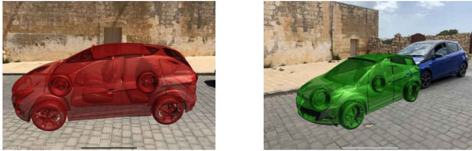
Figure 7: Concept 7. Left : non-yielding state with the red phantom car blocking the crossing area. Right : yielding state with the real car entering the green phantom car.