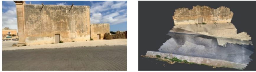
Figure 1: Left: The chosen unmarked crossing in Malta. Right: The captured LiDAR 3D scan on location.

representing different design elements were added to the board. The authors also used experience-based design to reach decisions. In total, the brainstorming was spread across three separate sessions for a total of 5 hours.