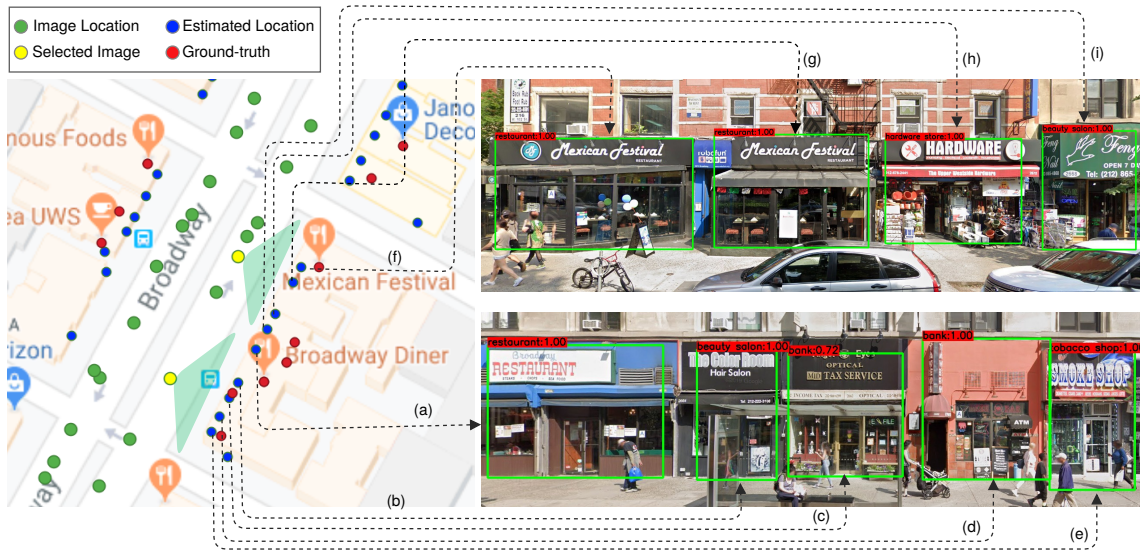
Figure 3: Example applications of our detection, classification, and mapping method.

The predicted set of labels \hat{L} are sorted by classifier’s confidence. Then, we define the top k prediction set \hat{L}_k as the first k elements in \hat{L} , where k \in \{1, 5\} . The prediction of business category \hat{L}_k is confirmed as True Positive, if one label of \hat{L}_k is agreed by at least two human annotators, represented by L . If the best confidence score of top- k predictions is below 0.4, the label is considered as unknown, which is represented by OTHER on the list of business categories. As depicted in Table 4, our automatic method achieved 83.2% precision on detecting storefronts: it got 39 false positives out of the 232 detections. Then, we manually removed duplicate geo-locations from the list of the detections resulting in 60 unique businesses. It means a 61.9% recall at 83.2% precision:60 out of 97 businesses visible on Street View imagery were correctly detected.