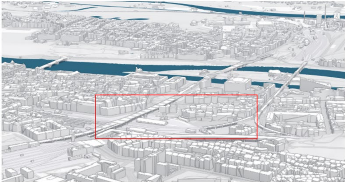
(a) The 3D digital model of Prague (IPR, 2023). The intended future building complex should be placed in the area marked by the red rectangle.