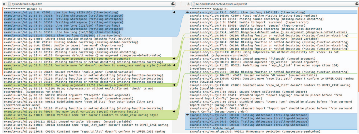
Figure 3: Screenshot showing difference between Pylint default output (left), and transformed output generated by MLsmellHound (right). Pylint warns about “e” and “df”, whereas MLsmellHound accepts these in the context of ML files. The output also shows that trailing-whitespace warnings have been re-ranked to a lower priority for ML files.

often uses short variable names inspired by mathematical conventions [26], thus we use an altered regular-expression for validating conformance to variable naming conventions when linting ML files.