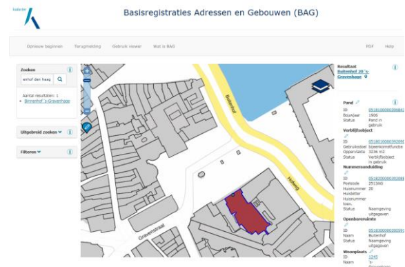
Figure 1: Example of Key Register Addresses and Buildings (BAG)

The direct effects of a semi-open BAG (0 Alternative) are lower transaction costs, less double collected data, better data quality, and more use by the private sector to improve their services and to create new products. The indirect effects are a more efficient and effective government, and new and more reliable value-added services. The direct effects of open data for all (+1 Alternative) are estimated at 2.6M€ due to lower transaction costs, and for linked open data (+2 Alternative) 0,4M€ as the extra costs of linking the BAG-data are circa 2.2M€. The societal benefits for the +1 and +2 Alternatives are circa 0,25M€ as consumer surplus. Societal benefits, such as improved fraud detection, cannot be quantified.