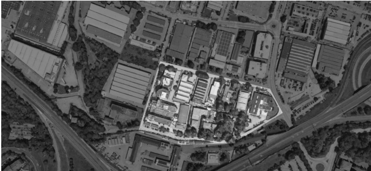
Satellite view of CINECA's Headquarters, Casalecchio di Reno.

Everything started in 1969, when the CINECA opened its doors in Casalecchio di Reno, six kilometers from Bologna. The choice of Casalecchio was mainly determined by the need to pick a location which could strategically serve the interests of the researchers who were supposed to work there – a site close to the highway, easy to access, and able to connect Bologna to other cities of Italy. 9