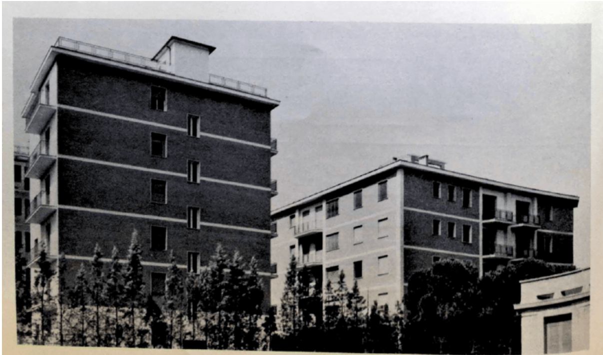
View of the two buildings hosting the CNEN, 1961.

Despite the unusual design for a nuclear energy research center, the interiors of these two buildings were massively transformed to be able to accommodate advanced computing machines such as the IBM 704 Data Processing System, the first scientific calculator purchased by the CNEN. The IBM 704 was the first mass-produced computer with hardware for floating-point arithmetic; it allowed complex math, and made it possible to conduct research on multiple levels, from physics to music, to game theory. The 704 required a huge amount of space to be installed and to run properly: it occupied the whole basement of one of the two buildings at CNEN – approximately 500 m 2 . 5 In addition, a raised floor was necessary to host meters and meters of cables, which transmitted signals from one unit of the 704 to another.