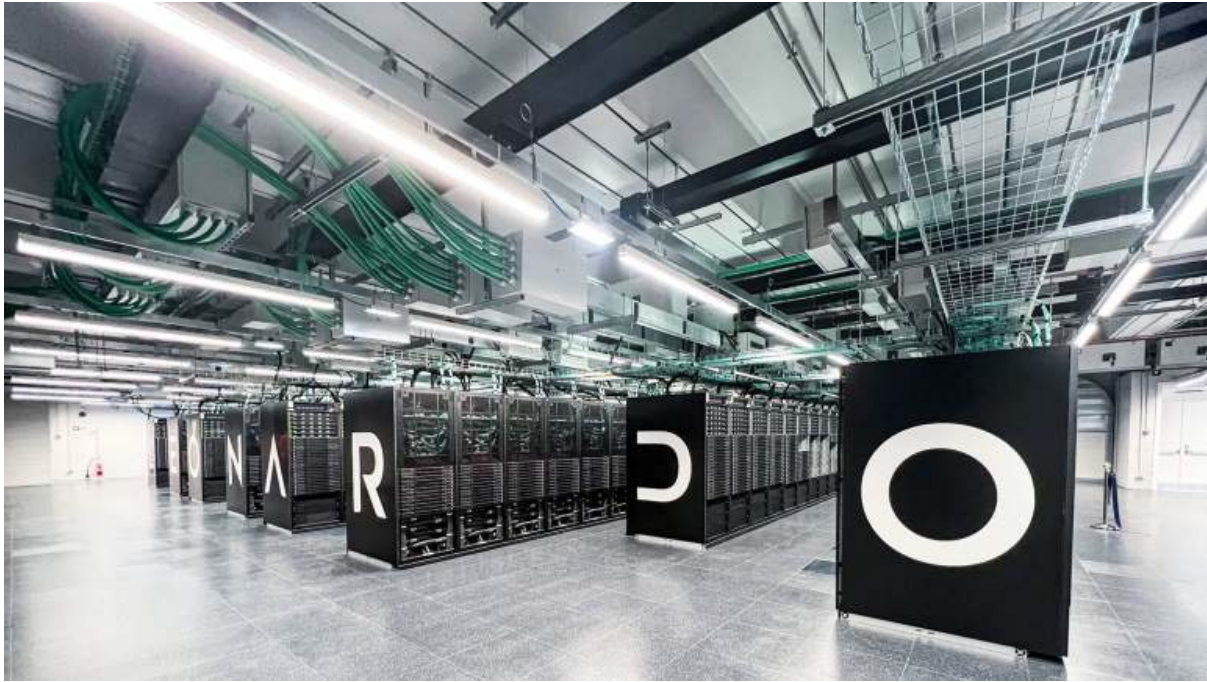
View of Leonardo's supercomputer.

The advanced character of this supercomputer is directly proportional to the number of spaces it needs in order to perform properly: the structure that hosts Leonardo, in fact, develops across three different levels, to accommodate all different forms of infrastructures: in the basement, are four independent tunnels that serve the cooling system; the ground floor hosts the so-called white spaces – the space which includes racks, servers, storage systems and electrical distribution; and on the first floor, four power stations have been installed. Leonardo's white space is characterized by radiant floors, which allow the passage of cooling pipes.