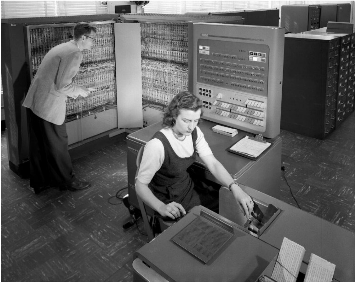
An IBM-704 computer in 1957.

At the end of the 1960s, a new site for the CNEN headquarters was chosen outside of the city center, in the area of Arcoveggio, where more existing buildings were available. In 1982, the CNEN became ENEA (Ente per Le Nuove Tecnologie e l'Ambiente), whose mission was to promote research in the field of alternative energy, new technologies and the environment. The ENEA is today a national institute with different branches across the national territory.