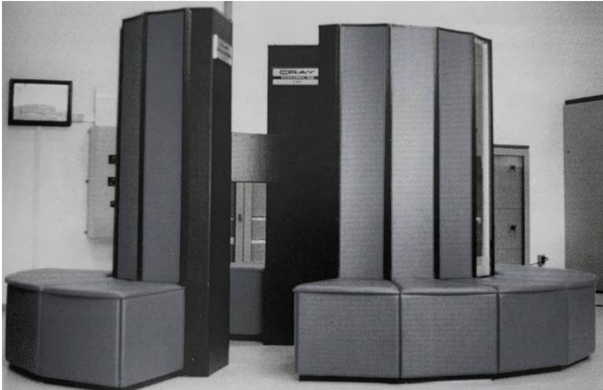
Control room of the CDC 6600 – CINECA, Bologna.

At its foundation, the CINECA only counted 20 employees, but its role within the national boundaries has been progressively increasing; in 1998 it counted 90 employees, rising to 170 by 2000. Today, it employs more than 500. Similarly, while in 1969 the CINECA consisted of only one building and one warehouse, today its headquarters stretch over an area of 17,000 m 2 across a total of five buildings. Furthermore, in Bologna, Rome, Milan, and Naples, all CINECA's buildings follow specific design guidelines in terms of energy efficiency, circularity, and water management. Its interiors are characterized by recycled materials and timber elements; climate control is achieved through systems of shading and passive techniques.