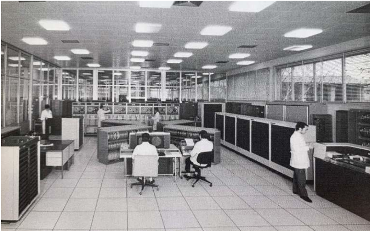
Control room of the CDC 6600 – CINECA, Bologna.