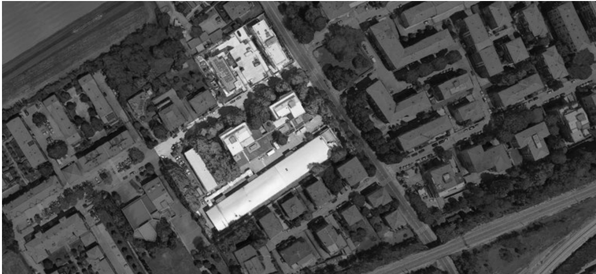
Satellite view of ENEA's Headquarters, Bologna.

The ENEA's complex integrates other lab facilities, such as the so-called Centro di Montecuccolino , which was originally opened in the 1960s by the CNEN and the Faculty of Nuclear Engineering at the University of Bologna to conduct research on experimental physics. At this site, three nuclear reactors were initially installed. While two of the reactors concluded their activity of research at the beginning of the 1980s, the last reactor was closed after the 1987 national referendum on nuclear energy. 7 The buildings that originally hosted the reactors were reconverted to new uses. Today the Montecuccolino Centre consists of three buildings, connected through skybridges, accommodating offices from the University of Bologna, labs, and a library. The building hosting the third reactor is now to be dismantled for good.