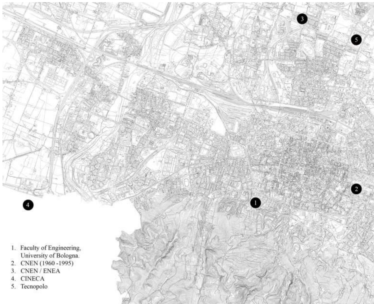
Map of Bologna's major computing centers.

academic institutions which helped turn the city into a testing ground for new technologies and new processes of modernization. 1