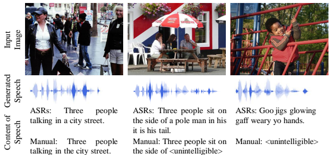
Fig. 3. Examples of bad synthesized spoken descriptions. The <unintelligible> in the manually transcribed text means that the corresponding speech is unintelligible.