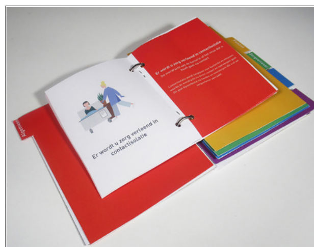
Figure 2: Example page of the information bundle.

We found that patients differ in their experience of contact isolation from being overwhelmed to being compliant or appreciating the isolation. Information about contact isolation was neither universally structured nor tailored to patient needs. Informing patients about what is happening and why, and explaining how long the precautions will continue, is suggested to make the isolation more tolerable [10]. This information should contain practical information about the precautions and address feelings of stress and fear, which are considered normal in isolation [1,2]. Our findings support these insights. Furthermore, our suggested information bundle aims to provide this practical information as well as to address experienced feelings of stress and fear. The information bundle can elicit conversations between the patient and health care worker. This way, it provides opportunities to personalize the information and support health care workers in order to meet the needs of the individual patient. This is in line with previous suggestions that each individual requires support and care in their own specific way, even when applying uniform isolation policies [11].