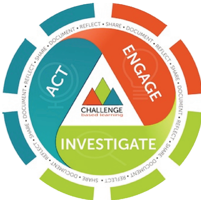
Fig. 2. Cyclic phases of Challenge Base Learning. ( https://cbl.digitalpromise.org/stories/ ).

solutions: and (3) engaging phase in which the students leverage the interaction with the tutor and his peers to solve the problem. This strategy supports the development of knowledge acquisition in an autonomous manner, development of transferable-skills or essential-skills and life-long learning (Ruiz-Ortega et al., 2019). In this strategy, the student-tutor interaction is employed to support the problem-solving stage rather than the knowledge acquisition (KOLMOS, 1996). We report examples of how different instructors implement either PBL or CBL in Appendix 3 in Supplementary material.