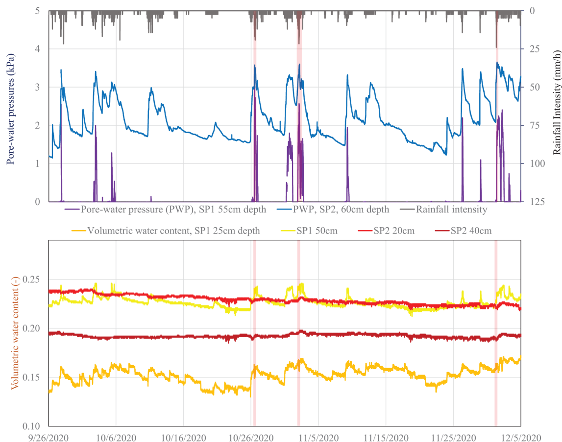
Figure 1. Time series of rainfall and pore water pressure and volumetric water content in two soil pits (SP1 and SP2) recorded on a steep hillslope above Sitka, in southeast Alaska, observed during a sequence of large storm events in October–December 2020 (dates in UTC); the days on which landslides occurred throughout the region are shown by the transparent red bars. Note that data are available for download in Smith et al. (2023), and near-real-time plots of data are available for situational awareness at https://usgs.gov/programs/landslide-hazards/science/sitka-ak , last access: 11 November 2024.

ray neutron sensors have the capacity to estimate changes in relative hillslope wetness between storms (e.g., Francke et al., 2022), yet these methods remain largely untested for landslide studies in steep, densely vegetated terrain. At the scale of tens to hundreds of kilometers, distributed estimates of soil moisture from remote sensing provides global coverage but falls short of capturing the temporal variations observed in situ that are critical for precise landslide forecasting (e.g., Thomas et al., 2019). Novel space–time approaches leverage extensive information on timing and locations of past landslide occurrences to simulate the evolution of landslide probabilities across a given landscape during storm events (e.g., Lombardo et al., 2020; Bordoni et al., 2021). Although these data-driven approaches are inherently biased by the available data, emerging approaches for integrating the rainfall triggering with the underlying landscape characteristics seem quite promising (Steger et al., 2024) and would likely benefit further from considering local hydrologic information. Ongoing efforts to incrementally improve