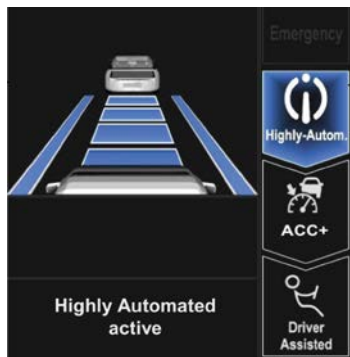
Fig. 1: A possible combination of three display components. These components were proposed in the HAVEit project as essential. From [8].