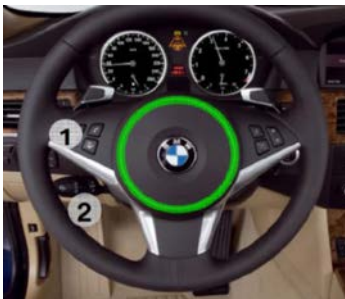
Fig. 6: BMW's tested interface for Traffic Jam Assist. From [20].

important potential in HMIs for automated driving [15, 4].