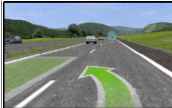
Fig. 4: Simulator implementation of augmented reality. From [23]

The selected results of this survey indicate that several promising visual displays have been proposed for automated driving.