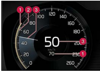
Fig. 3: Example of an informative speedometer on the market. 1) Set speed 2) Speed of the detected target vehicle 3) Current speed of driver's vehicle. From [24]

speed for the ACC, and the speed of the car in front. The speed limit can be included as well (or in the automation monitor [8]). The concept of the informative speedometer is currently applied in consumer cars, such as the Volvo XC90 2016 (Fig. 3).