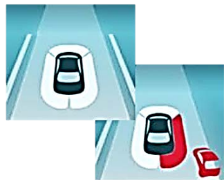
Fig. 2: Example of the Safety Shield implementation. From [3].

However, automation can have various adverse effects [7]. Dangerous situations can occur when the driver has to take back the control of the car within a short amount of time. Furthermore, misuse or disuse may occur when the driver over-trusts or under-trusts the automation, respectively [14].