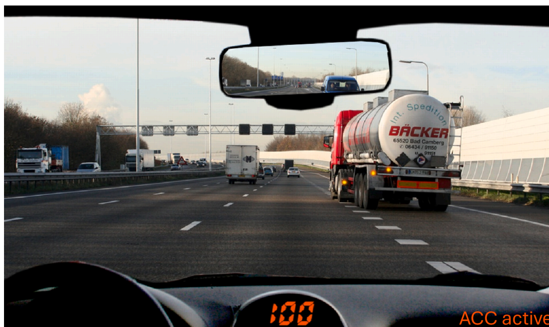
Fig. A4. Second scenario for preparatory survey version B. Caption shown to participants: “Driving with adaptive cruise control active on the highway at 100 km/h”. The hazard in this scenario concerns a speed differential with a truck intending to merge, combined with the notion that adaptive cruise control is active. In the Netherlands the maximum allowed speed for trucks is 80 km/h. . Reprinted with permission.