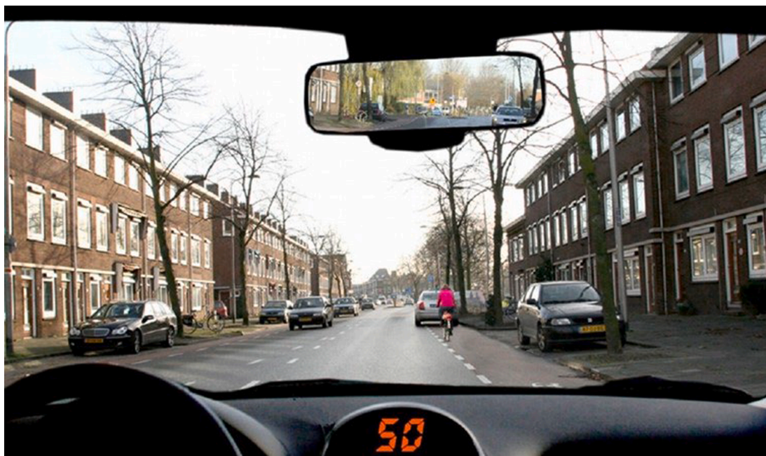
Fig. A3. First scenario for preparatory survey version B. Caption shown to participants: “Driving in the inner city at 50 km/h”. The hazard in this scenario concerns a bicyclist about to overtake a parked car. There is no room for the subject vehicle to overtake the bicyclist, due to oncoming traffic in the opposite direction. . Reprinted with permission.