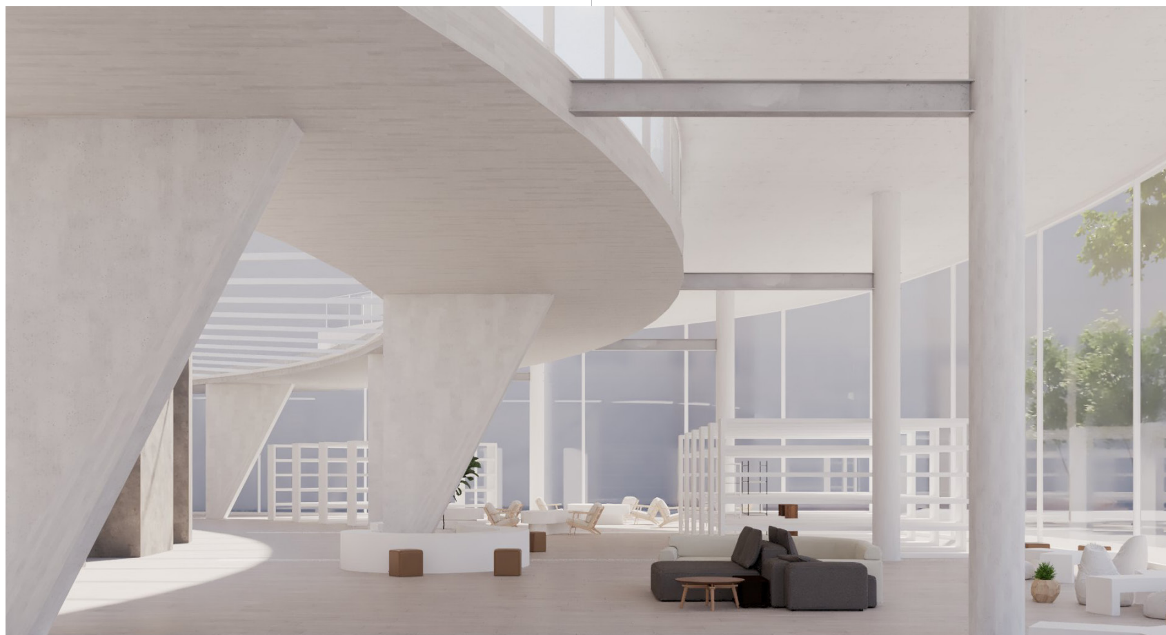
Interior view of the extension