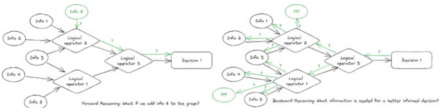
Fig. 2 Forward and backward reasoning. Forward and Backward Reasoning: Forward reasoning can be thought of as a form of what-if reasoning where the reasoning starts from the information and moves forward. Backward reasoning can be thought of as an evaluation where the reasoning starts from the decision and moves backward. The green color represents the respective reasoning paths

With respect to formal reasoning, two directions can be distinguished. These directions are forward and backward reasoning; see Fig. 2. Backward reasoning, in the current context, is about recreating trails and possibly gathering more information to demonstrate proof of the proportionality and subsidiarity of actions for each TIHW component and for the entire TIHW. Forward reasoning, in the current context, could be used in building an actionable strategy with minimal uncertainty. The challenge at hand is that there are no such reasoning tasks that minimize the uncertainty on process level for threat intelligence and also, with respect to proportionality and other legal and societal constraints, in a domain agnostic way.