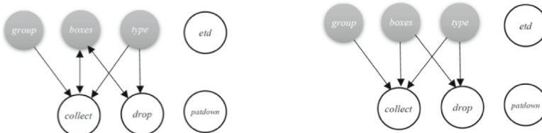
(a) The generated graph for the char. model. (b) The expert-based corrected graph for the char. model.

To this end, we remove the links group_p \leftrightarrow group , type_p \leftrightarrow etd , type_p \leftrightarrow type and dropp \rightarrow group . Another important factor that we use to correct the graph, is the assumption that the passenger under consideration cannot influence the characteristics or behavior of the passenger that is next in line.