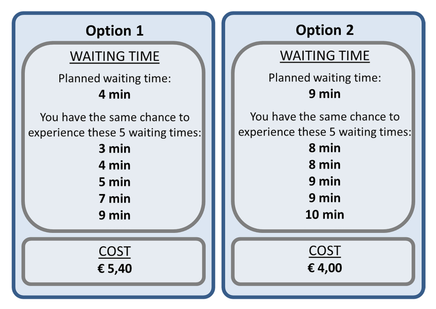
Fig. 2. Example of a choice task of the waiting time SP experiment.

distributions makes it difficult to have pivoted experiments. To still present respondents with trip times they could relate to, we divide individuals in two segments: those with a reference trip of short distances (< 12 km) and those with a reference trip of medium distances (> 12 km). We present them values accordingly (short and medium version of the experiments), similar to the approach followed in Arentze and Molin (2013).