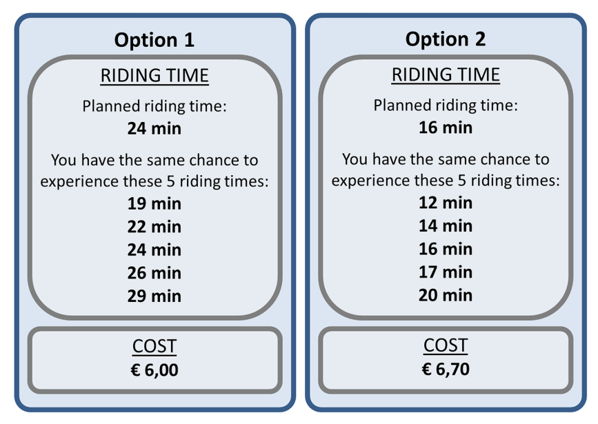
Fig. 3. Example of a choice task of the in-vehicle time SP experiment.