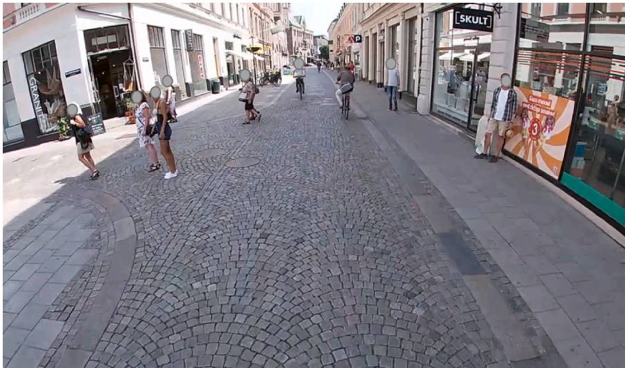
Fig. 1. Illustration of Shared Space for Data Collection.

categorical, continuous, nominal, and combinations of these types) without prior standardization, preventing bias in the results. The most important advantage of the latent class modelling, however, is that observations are allowed to belong to all classes with different probabilities. This is in sharp contrast with the conventional clustering techniques which deterministically separate the data into clusters.