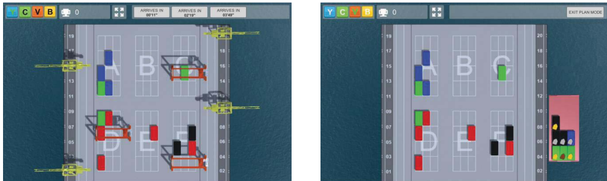
Figure 1: Screenshots of the YCS3 game (TU Delft, 2017)

In the YCS1 game, the individual player could view all plans and operations of all the roles, whereas in the YCS3, each role has a different access to various planning and operational tasks. The berth planner can only access the quay cranes, while the controller can only access the yard cranes. The yard planner can plan the containers from the ship on the yard, while the vessel planner needs to decide on the order in which the containers need to be unloaded. There is also a certain sequence of actions that has to be followed by the players. The controller cannot allocate yard cranes before the yard planner finalized the yard plan, and the berth planner cannot unload the ships until the vessel planner did not allocate an unloading order. The learning goal of this game is that the players understand the need to communicate and collaborate with each other to align their plans with each other. Only by doing so, they are able to reach a high individual and group score.