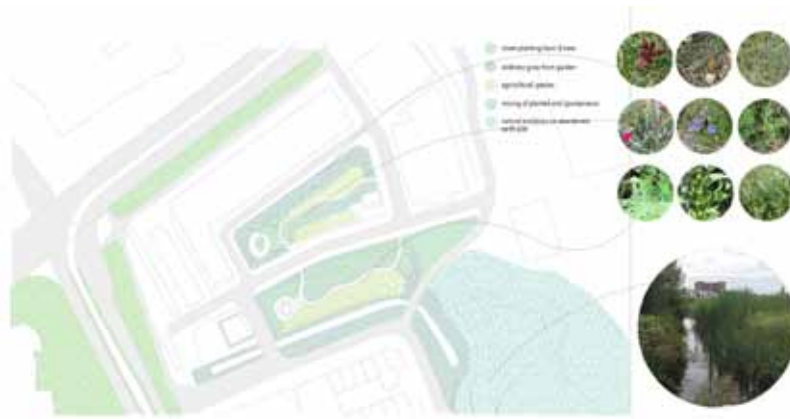
Figure 3. Inside the garden there are traces of wildness, but its dynamic still contrasts with the unbounded wildness growing on the adjacent leftover earth pile. Draw by author.

the current ecosystem is manipulated by human-centred relationships, however the presence of non-human forms of life is equally crucial for urban livability: 'urban livability involves civic associations and attachments forged in and through more-than-human relations' (Hinchliffe and Whatmore 2006: 137).