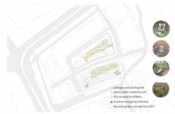
Figure 7. The changes took place in the garden until 2018, after three years of use. Draw by author.

programme further attracted more local people to visit the site, doubling the number of its visitors. It is now regarded as a gathering place and a green oasis hidden in the bustling Dalston district.