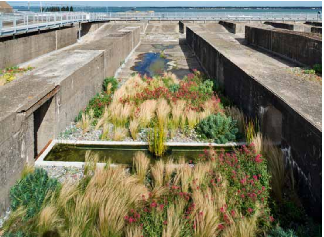
Figure 8. Jardins du Tiers-Paysage (gardens of the third landscape), Saint-Nazaire. The design keeps the site's indeterminacy through magnifying nature process.

Although the richness of this wild nature might be appreciated, it can hardly be related to the story of the garden (as a public agricultural site) or in other words, seeing them as meaningful part of the place. The initial formal design is too weak to frame what might happen and how they relate to the site. From this perspective, Jardins du Tiers-Paysage (gardens of the third landscape) in Saint-Nazaire's submarine base of Saint-Nazaire (Gilles Clément, 2009) provides a comparison (Fig. 8). The design intentionally keeps spaces for a spontaneous evolution of local ecology, but the form of the space is elaborated according to the character of the submarine base. The emerged landscape tells the story of the site; a link between visitors and the site is enhanced by this newly growing wildness.