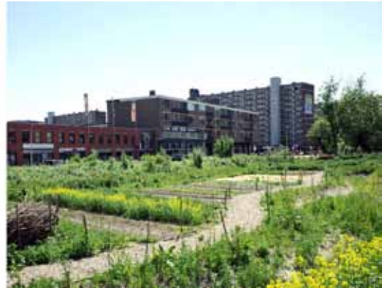
Figure 1. PROEFTuin, before and after the design transformation.

PROEFTuin in Delft is such an example (Fig.1). The users like the garden; it is a green space that sticks out in the surrounding environment of industrial warehouses and apartment buildings. However, upon entering the garden one can hardly find it is an intriguing place, as it is similar to other urban agricultural gardens: a collection of cluttered planting beds, boxes and agricultural facilities. The functional approach to the design subordinates the spatial qualities, resulting in casually placed different programmatic components. Visitors who enter the garden as ‘outsiders’, may hardly be able to orient themselves or attach to the place, nor would they stay in the garden since it doesn’t cater for other forms of activities. Two years after its opening, the garden was removed for a future housing project. Although the fate of the garden was largely decided by the development authorities, it might also relate to the design: the design merely considers itself a temporarily fill in the short break of the site’s transformation, without any intention to project itself into its long-term trajectory. In other words, there were not much efforts to include the design in the future planning of the site. Looking back at its ‘leftover status’, as a space with a thin layer of grass open to various way of using, the design transformation animates the social practice of the space, but simultaneously closes it into a new