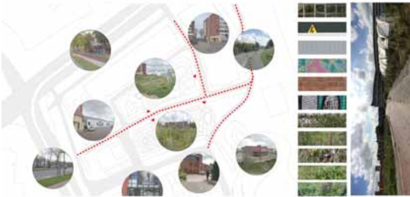
Figure 5. The dense vegetation inside the garden recalls a sensation of being in a secrete oasis. However the perception of the place is later limited to an ordinary vegetable garden, recognizing little uniqueness of the site. Draw by author.

compositional framework of the site. The agricultural plots are located in the centre, surrounded by affiliated functions and leaving the margins unkempt and gradually occupied by wilderness. The design intended to make a circular route to connect the two parts of the garden that are divided by the urban road running in-between. However, only part of the route follows the compositional logic of the surrounding buildings, where the other is shifted from the axis offered by the buildings. Loose wood poles connected by a thin string of wires roughly define the boundary of the garden to the road in-between, while other boundaries are made by earth piles, hardly related to each other or elaborating the relationship between inside and outside. (Fig.4)