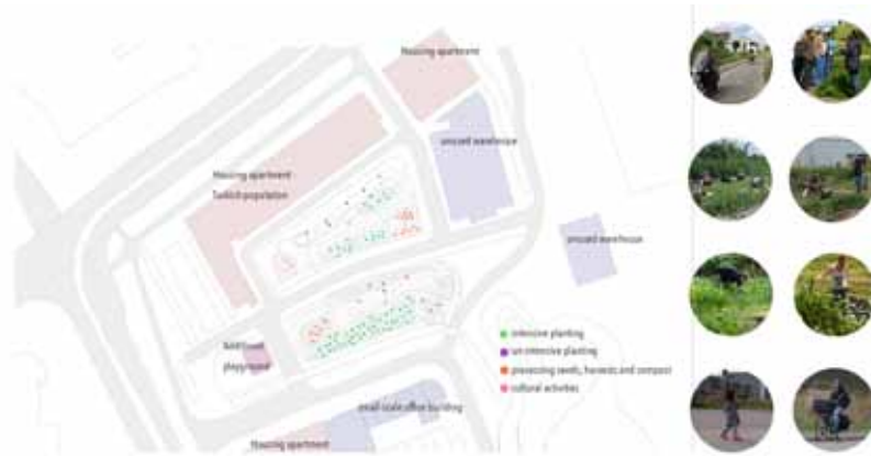
Figure 2. Current activities taking place inside the garden—the majority is setting under the agricultural theme, leaving little spaces for other practices. Draw by author.

various uses, as alternative spaces for those everyday informalities that are not met in designed public spaces with their specific behaviour codes. This temporal, marginal and informal dimension of space embodies the 'lived space' constructed by everyday practices, resisting the dominant image of the city that is determined by programmatic requirements (Lefebvre 1991:39).