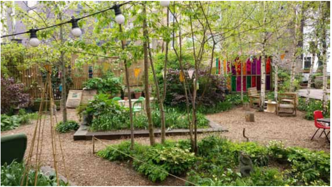
Figure 6. Dalston Curve Garden, London. After the design transformation, the previous linear interstitial space opens to wider social groups and practices.

the established epistemology and thus forcing the visitors to encounter the site with the perceptions from their body. As Edensor pointed out: ‘the things are always enmeshed within specific cultural contexts and embody particular histories’. Leftover spaces are where people can unlearn the conventional meanings of things, releasing new interpretations beyond their assigned cultural and historical background (2005: 99).