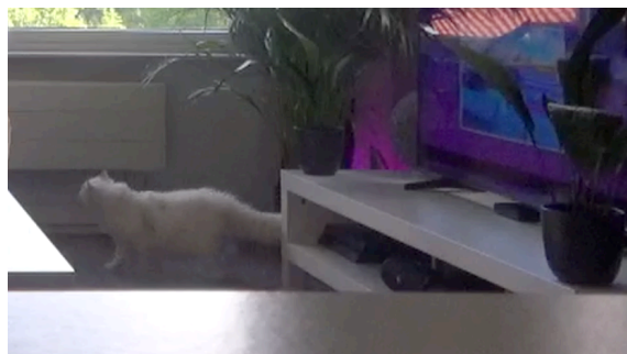
Fig. 2 – The cat on its way to jump on the convector.

As already noted in some examples above, sense-making is often not a one-stop data encounter. It can involve drawing on multiple types of data and active investigations. We have clustered these data encounters as complex contextual sense-making (Table 5).