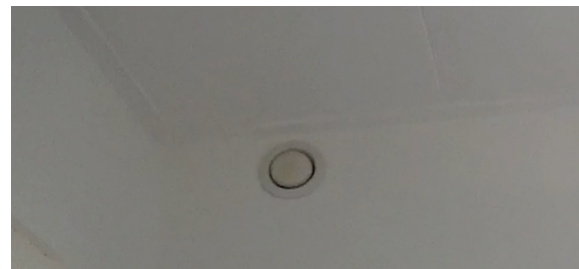
Fig. 3 – A slightly visible change in colour of valves.

black." She explained that they informed her of the unclean state of the air, and of the status of the mechanical ventilation system (Figure 3).