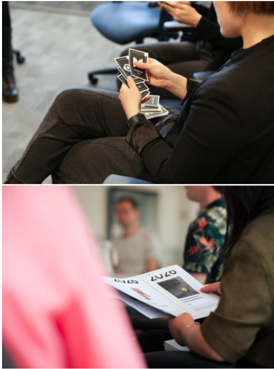
Figure 2: Pretesting the materials with stakeholder experts.

design practitioners and data scientists, engaging six people in total. At ACRC, four testing sessions included design researchers, care researchers, and experts from a Public and Patient Involvement (PPI) group. The PPI group included people aged 55 – 70 age, whom ACRC has recruited as expert users for care focused research projects. Testing sessions including academics with experience in care research, data scientists and engineers, design researchers and 12 domain experts with diverse backgrounds in technology, business, care, and more, engaging 22 people in total.