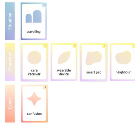
Figure 3: Top: Roleplay workshop with two older adults and two actors. The materials are displayed on the wall in addition to being handed out at the table. Bottom: Card selection for “When traveling fails to happen”

the challenge of traveling with battery powered devices. The Smart Pet 's battery status and reminders caused some stress for the owner P. The Wearable Device suggested more conversation as a calming method. P said she felt a little overwhelmed by too many notifications and concerns – “too much control”. She finally decided that she wanted to be alone with her pet – but said “don’t touch me if I don’t ask for it” – and watched TV. She asked the neighbor, with some guilt, to leave, with an opening for more interaction in the future. The Wearable Device announced that P’s blood pressure began to drop.