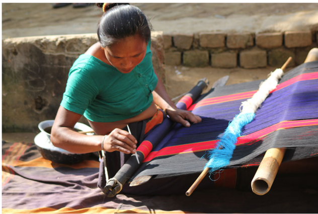
Fig. 1 A tribal (chakma) woman making her cloth. Photo by Hasib Wahab taken on 25 December 2012, Flickr ( https://flic.kr/p/dR3mM ). CC BY-NC-ND 2.0. Accessed 1 January 2021

whose traditions and “ethos” are not welcomed by host communities possibly “remain the mindset of exile, not citizens” (Scarre et al. 2019).