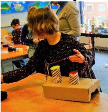
MUSIC MACHINE WITH STRINGS

Last but not least, even children, with a passive stance during regular courses, started active, enthusiastic and targeted.