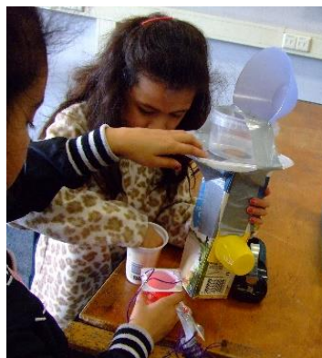
UNDERGROUND LITTER BIN