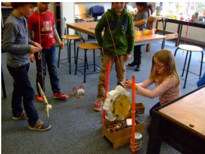
WATER-WHEEL, DRIVEN BY MARBLES

• Fourth episode: Tinkering hour to bring forth the results of the hands-on learning. In this last episode, the children had to make something themselves. The given instruction was: "After experimenting you have to make something yourself. You can make what you want. I am interested to see what you are going to make. It is nice, when you make something that has several combinations, and all the parts making a big machine. You are allowed to use material and components you experimented with earlier". The children could choose between the making assignment described above or a handicraft task. Thirty nine of the forty children choose to do the making assignment. The fortieth child first chose the handicraft task, but after ten minutes she selected the making assignment, because a plan to make a guitar came up. All children started quickly. Eighty percent of the children worked till the end of the working time on the task. The children spontaneously collaborated in groups