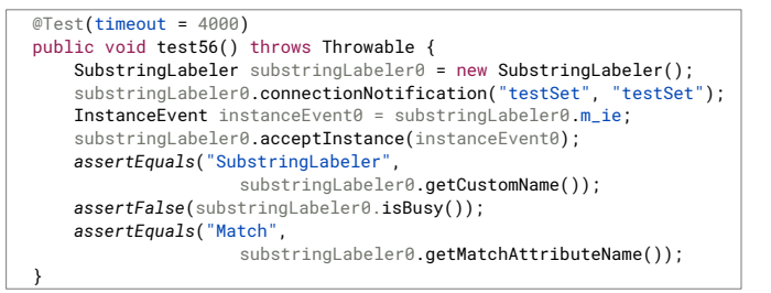
Fig. 4: Example of eager test.