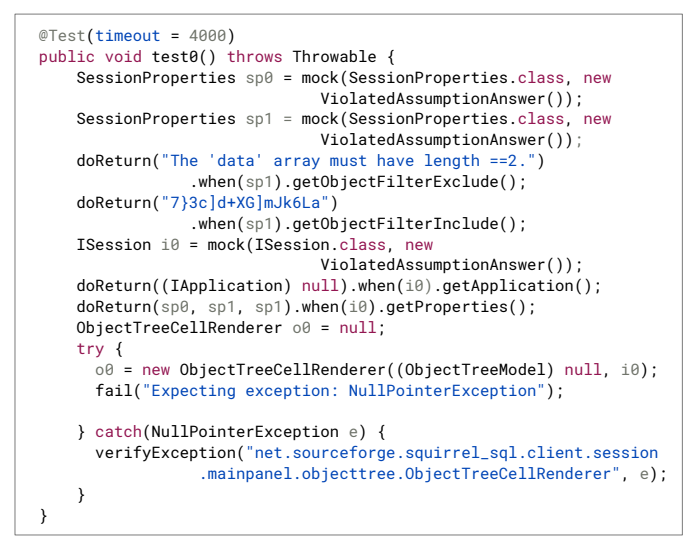
Fig. 9: Example of a test case with failed setup.

"coverage" and real-world validity of test cases; addressing this could lead to more useful support for developers.