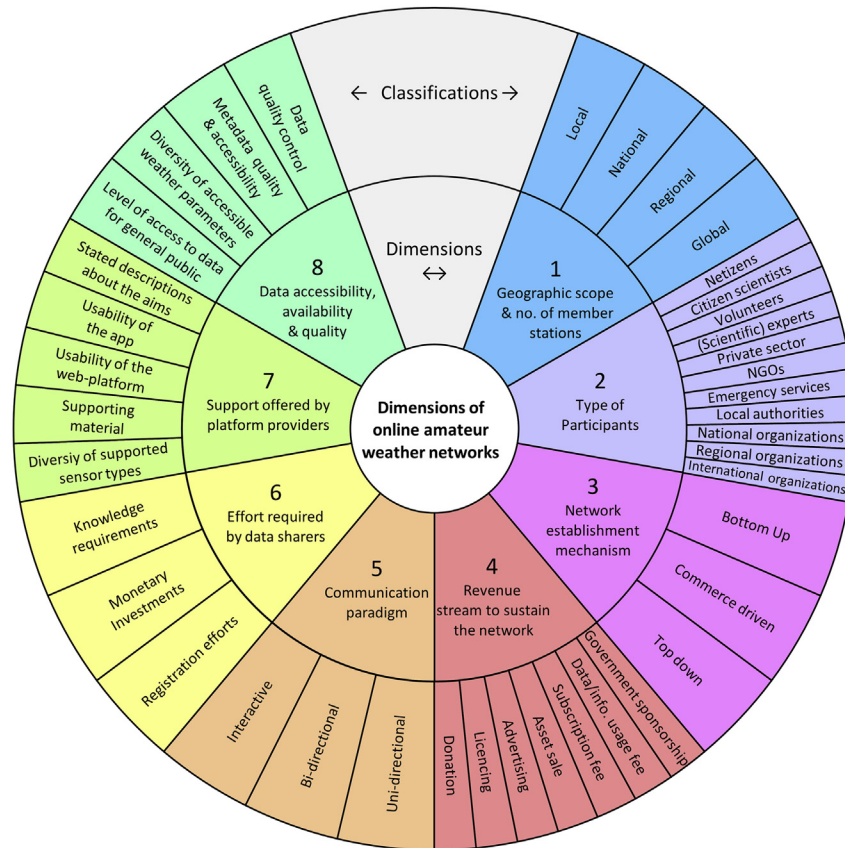
Fig. 1. Conceptualization of the features and functioning of online amateur weather networks in this study.

a relatively small Dutch weather network (with ~375 members) that only hosts stations from the Netherlands and Belgium. HWA is also categorized as a supranational (regional) network since it incorporates stations from more than one country.