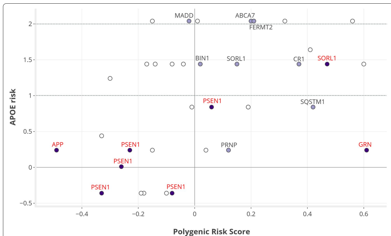
Fig. 2 The AD risk based on APOE and polygenic risk score (PRS) in the 36 families. Each node represents one family, with PRS plotted on the x-axis and APOE -risk on the y-axis. The effect sizes of PRS and APOE were scaled to the mean of an in-house population-based control dataset ( n = 980 ). For interpretation of the effect sizes: 0, OR = 1 ; 1, OR = 2.7 ; and 2, OR = 7.4 . The horizontal lines for APOE -risk indicate families with risk > 1 (i.e., at least one APOE - \epsilon 44 carrier) and risk > 2 (i.e., fully segregating with APOE - \epsilon 44 ). Dark colored nodes depict families with pathogenic variant ( n = 8 ), whereas light colored nodes represent families with a variant of uncertain significance ( n = 8 ). Families with a pathogenic variant are clustered in the lower left corner, with a minor impact of APOE and PRS. Other families in the same region, yet without monogenic defect, would be suitable candidates for further genetic evaluation. Families with a relatively high APOE burden are located in the upper part of the plot, which also includes most families with a VUS. The overall contribution of PRS seems modest (average \beta = 0.05 , OR = 1.05 ), with the highest risk observed in the family with a GRN variant ( \beta = 0.61 , OR = 1.84 )

For our prioritized set of genes, we performed a genetic association test on both gene and variant levels, using exome sequencing data from Dutch studies contributing to the ADES consortium. None of the genes or variants tested was significantly associated with EOAD nor LOAD in this dataset as compared with controls (Tables S7-8), although 40/78 very rare variants could not be tested due to limited power. The most significant association was found for LRP1B in patients carrying variants with CADD > 15 ( OR = 1.13 , unadjusted P = 0.08 ). The largest effect was found for variants with CADD > 25 in the gene RBFOX1 ( OR = 2.14 , unadjusted P = 0.15 ). In the per-variant analysis, a missense variant in FNDC1 was present more often in cases compared with controls with nominal significance ( OR = 3.12 , unadjusted P = 0.03 ).