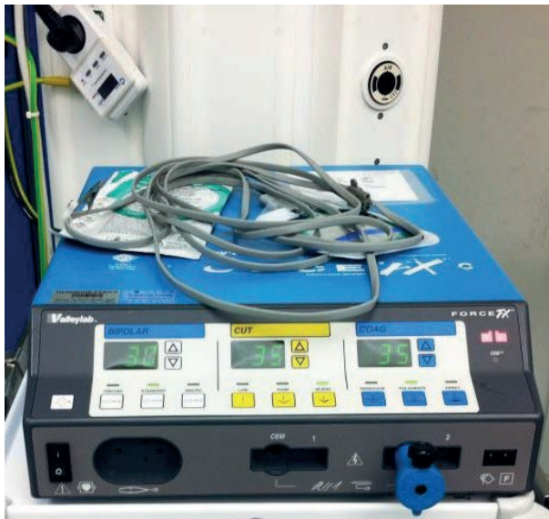
Figure 1. Electro-surgical device and current sensor (encircled).