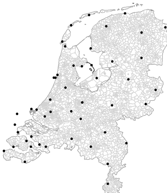
Fig. 2. The locations of weather stations and the size of postal code areas in the Netherlands.

distance between trips and weather station when a connection is made varies slightly for each type of weather variable and is lowest for wind-related variables at 12.8 km and highest for cloud-related variables at 14.1 km. Daily average values are collected from each weather station, weighted by the overall number of trips made in each hour. This means that weather during the night, which has relatively little impact on travel behaviour, is not influential whilst weather during travel peak-hours is weighted more strongly. To give an indication for the weather in the Netherlands during the sampling period descriptive statistics for the weather variables as connected to the trips in the MPN are given in Table 4 . The weather variables are standardized before inclusion in the model.