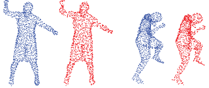
Fig. 2: Two frames of the dancer dynamic point cloud. The blue dots correspond to the original data and the red dots to the subsampled version.

In this section, we test the performance of the proposed sampling scheme for two different applications: subsampling a dynamic point cloud of a dancer, and active querying via subsampling for a recommender system.