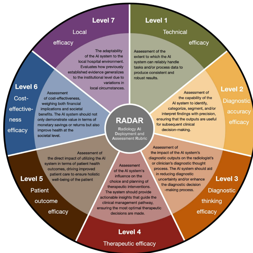
Fig. 2 Overview of the Radiology AI Deployment and Assessment Rubric (RADAR) framework, which could form a basis for early health technology assessment in radiology AI. The outer circle depicts the RADAR efficacy level, and the inner circle provides its description. AI, artificial intelligence. Reproduced from [35] Boverhof BJ et al (2024). Licensed under CC BY 4.0 https://creativecommons.org/licenses/by/4.0/

FUTURE-AI guideline is the hierarchically structured RADAR framework [35].