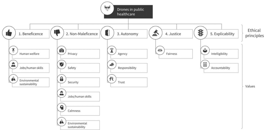
Fig. 2 The two top levels of the values hierarchy for drones in public healthcare, including ethical principles and human values. Practitioners must translate these into contextual norms, and then design requirements based on the specific use-case. The framework is meant as a starting point for ethical reflection in the development of healthcare drones that fill an instrumental (goal-directed) need. It should not be applied in an overly-rigid manner; instead, it should provide a framework of concerns and opportunities for engineers and designers to consider when developing drone technology (graphic by the authors)

“satisficing with moral obligations”, where morally-acceptable thresholds are set for the relevant values (van de Poel 2015).