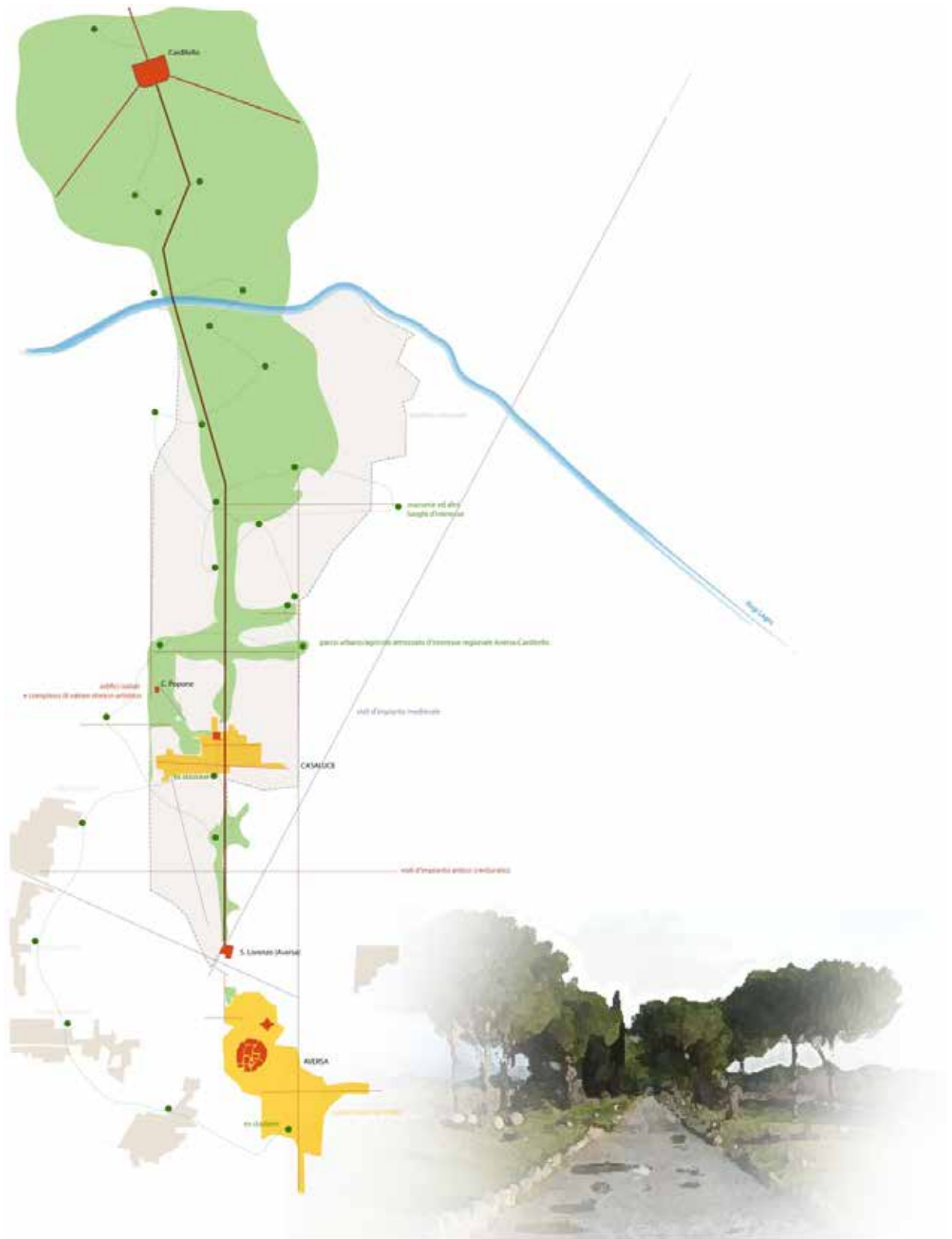
FIGURE 2 Casaluce City Plan 2015, Comune di Casaluce (CE)