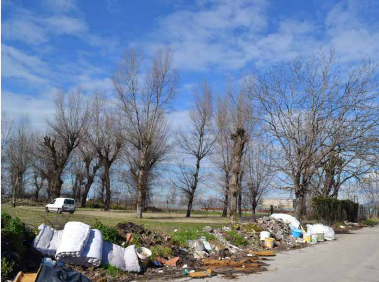
FIGURE 1 Casaluce (CE), March 2013