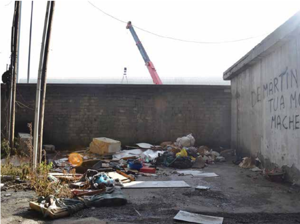
FIGURE 3 Wasted Landscapes of infrastructure in East Naples