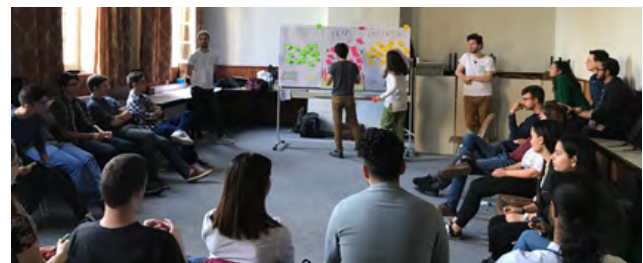
Figure 4: Train new trainers held in Leuven (Belgium). March 2019

During this event, participants from different European universities will have 24 hours to propose a solution to the challenge chosen and proposed by the companies collaborating within the competition. The solution achieved will be evaluated by taking into consideration several criteria, such as its business and technological feasibility among others. This project is being held in collaboration with Knowledge Innovation Market (KIM) Barcelona after a first online edition that proved to be successful.