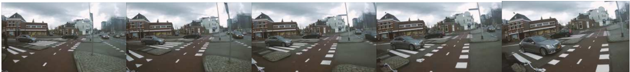
Figure 1: Final frames from the five freeze conditions of Intersection scenario 1 (left = very early end point, right = very late end point).

After each clip, participants were asked to indicate their responses to eight items: (1) perceived risk (indicated on a 7-point Likert scale), (2) potential cyclist's (own) behavior, (3) prediction of the driver's behavior, (4) certainty about the driver's behavior (7-point Likert scale), (5) factors that contributed to the prediction of the driver's behavior (multiple options), (6) priority rules, (7) number of times the video was replayed, (8) color of the encircled car (this was a quality control item). Items 2 and 3 had two response options based on game theory [7]: Yes, I would slow down vs. No, I would continue cycling at this speed and Yes, the car driver will slow down and let the cyclist cross first vs. No, respectively . It took on average 20 min to complete the survey.