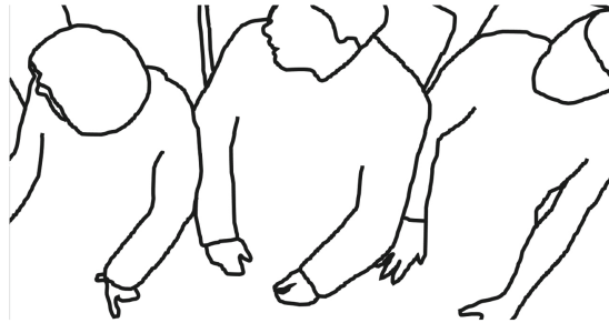
Fig. 6. In the staggered seat there is no shoulder contact and there is a separate space at the armrest.

The comfort score for the regular seat in this study is comparable to the results of the study of Anjani et al. (2020), who reported around 6 for 30'' pitch and around 7 for a 32'' pitch. The comfort score for the staggered seats in this study was 7, while in another study it was 7.9 (Liu et al. 2021) with the same staggered seat. However, in that study there were not always neighbors, which might indicate the importance of privacy. Torkashvand et al. (2019) showed that in a conventional configuration, the middle seat is the least preferred one, because of the contact to neighbors, however, passengers that travel in groups like to have seats next to each other and they do not bother about the shoulder contact. So, probably for groups this seat might not be ideal, but this issue needs to be further investigated.