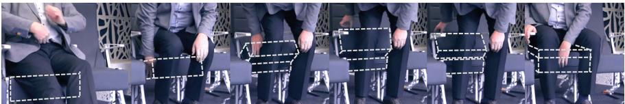
Fig. 3. To allow in- and egress and variation in posture the seat has the possibility of flipping up the front part of the seat.