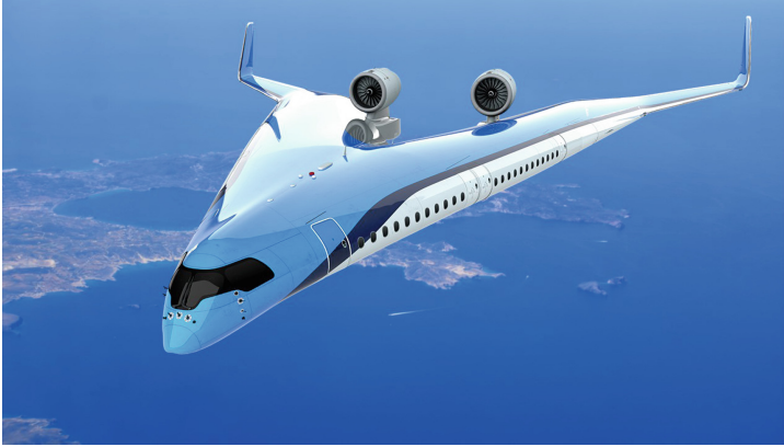
Fig. 1. An impression of the Flying V that is under development.

safety regulations do not allow an angle of more than 18^\circ from the direction of flight (Humm et al. 2016), for this reason, a staggered seat placed in the direction of flying was considered for the Flying V. This means that the seat has an angle of 26^\circ with respect to the cabin and the adjacent seat closer to the center of the airplane is slightly set back (Fig. 2); the front of the seat can be flipped up to enable in- and egress (Fig. 3).