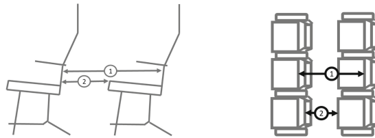
Fig. 5. Dimensions of the regular aircraft seat. 1 = 79 cm (31" pitch); 2 = 35 cm.

The two seats analyzed were positioned at 31° pitch, the regular aircraft seats were 18" wide, the staggered ones were 17.8" wide. It is worth pointing out that, the pitch of these seats is not comparable (Fig. 4 and Fig. 5) due to the 26° angle with respect to the flying direction of Flying V. Participants rated the overall seat comfort as well as the comfort of specific seat features using a 10-point Likert scale (1 = no comfort; 10 = extreme comfort) and the same scale was adopted to rate his/her privacy experience (1 = no privacy; 10 = extreme privacy).