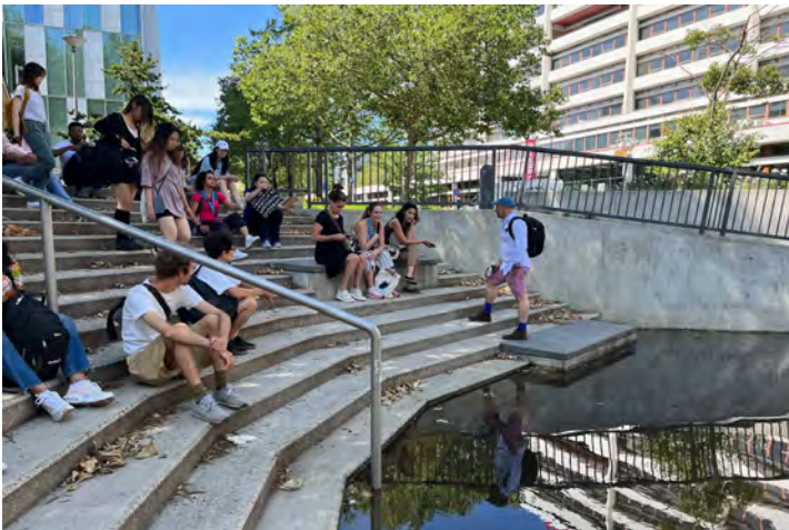
Fig. 4 Rotterdam walk