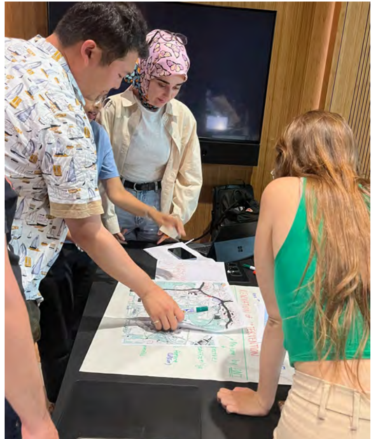
Developing the vision and strategy for the Maasterras

The idea of planning extends beyond knowledge collection and production to the creation of spatial development strategies and specific urban interventions. Planning is viewed as a social process, bringing together diverse actors, unique experiences, and dreams into a collective vision of development.