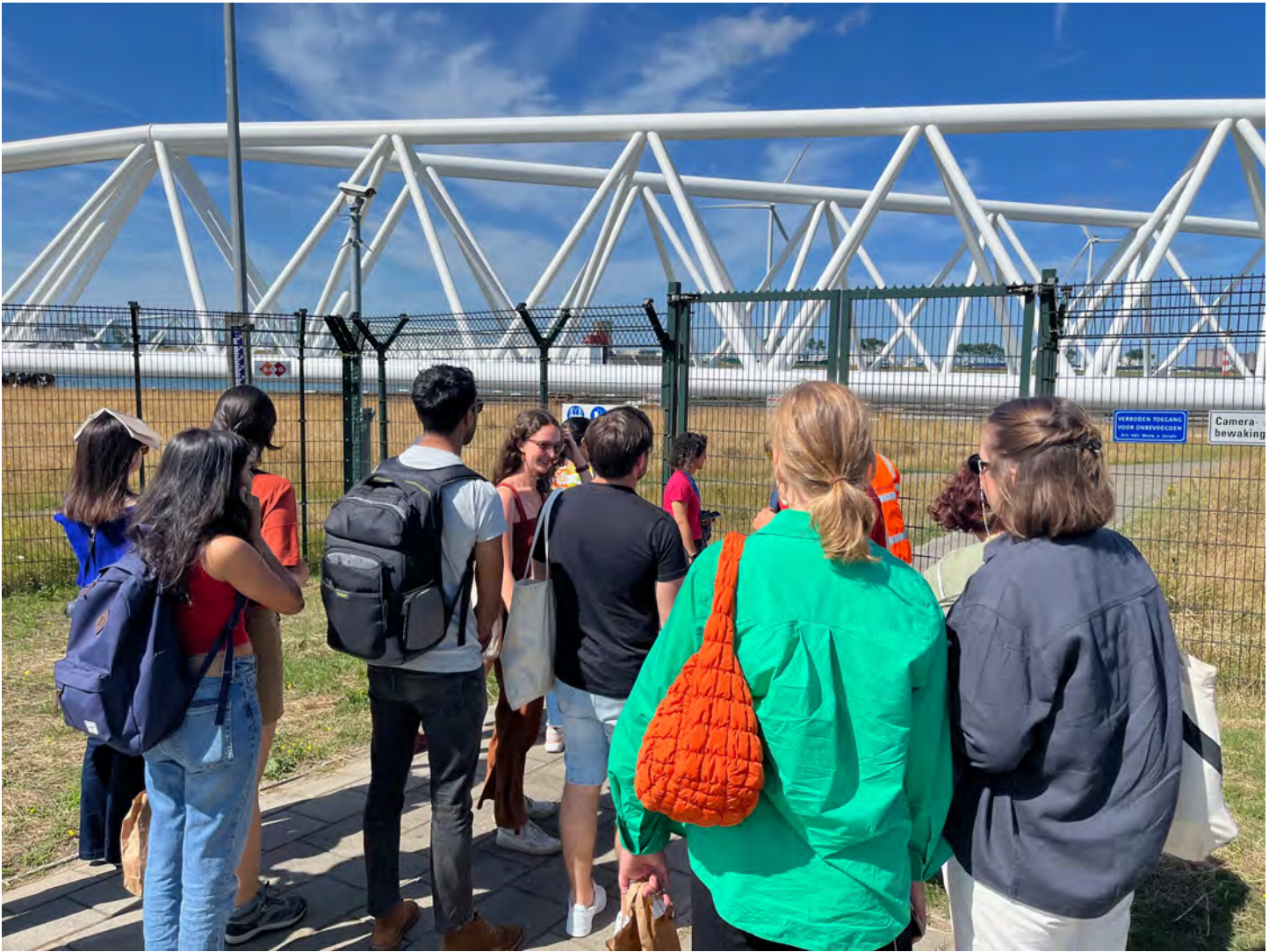
A visit to the Maeslantkering