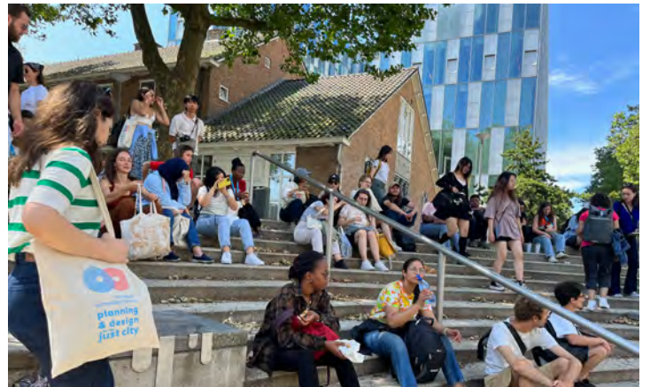
Fig.5 A rest at the Benthem (water) square

Two groups of students had the opportunity to showcase their exceptional manifesto projects. These groups were recipients of the Manifesto Award from the Centre for the Just City's manifesto event, and they shared their groundbreaking ideas during their presentations. These presentations served to inspire and provoke