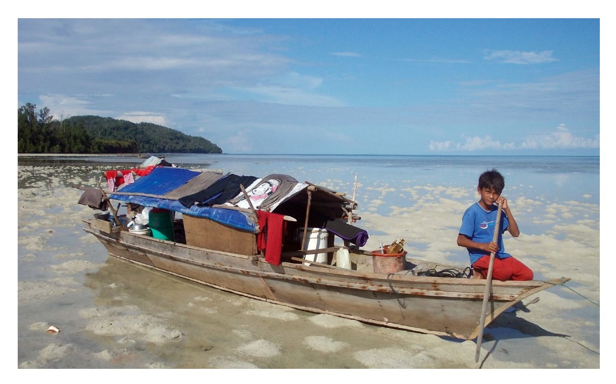
↑ Fig. 4 A lepa used by a family on Danawan Island (Source: Abrahamsson, 2011).