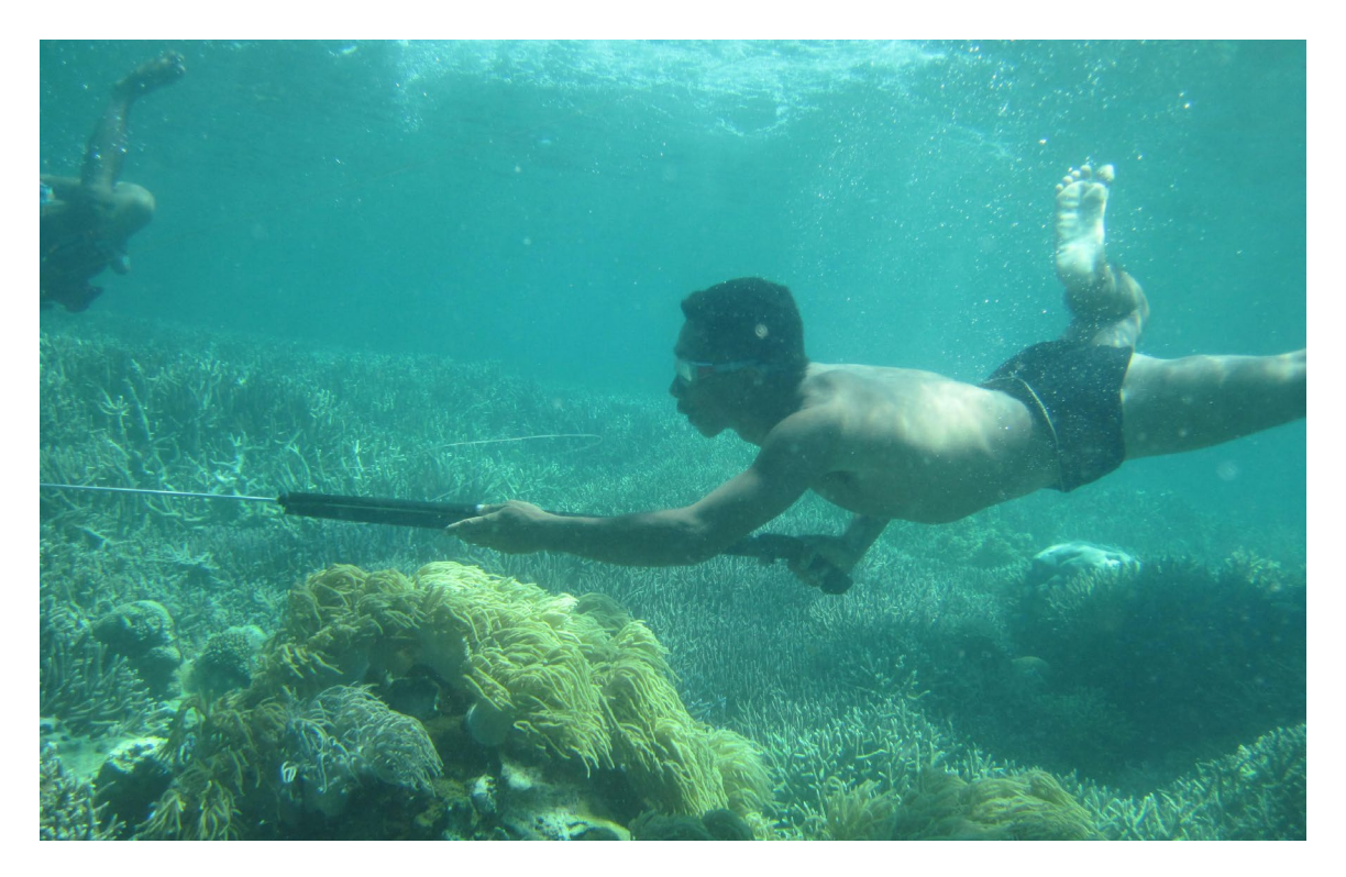
^ Fig. 6 Bajau Laut speargun fishermen, Kulapuan Island, Semporna (Source: Abrahamsson, 2012).

faces extinction due to the legacy of colonization, modern economic models, and biased land-based systems.