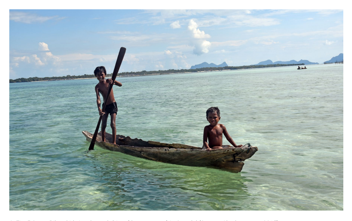
^ Fig. 5 Sama Dilaut kids in a buggoh/birau (dugout canoe) in Omadal.