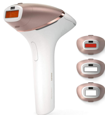
Figure 1. IPL device

The Philips Lumea Prestige is an IPL device that prevents the regrowth of hair (Philips, 2021). We decided to use an IPL device for our study because it is a personal care product that is intimately used, and therefore more likely to trigger contamination concerns. Furthermore, the price of the device (370-500€) makes it attractive to buy in a refurbished state because of the considerable amount of money consumers can save. Moreover, it is designed for a particularly long product lifetime (15+ years) and is available in different product states (new, refurbished, and second-hand). It is therefore a product for which refurbishment makes sense as a lifetime extension strategy and it was possible to find consumers who bought it in a reused state.