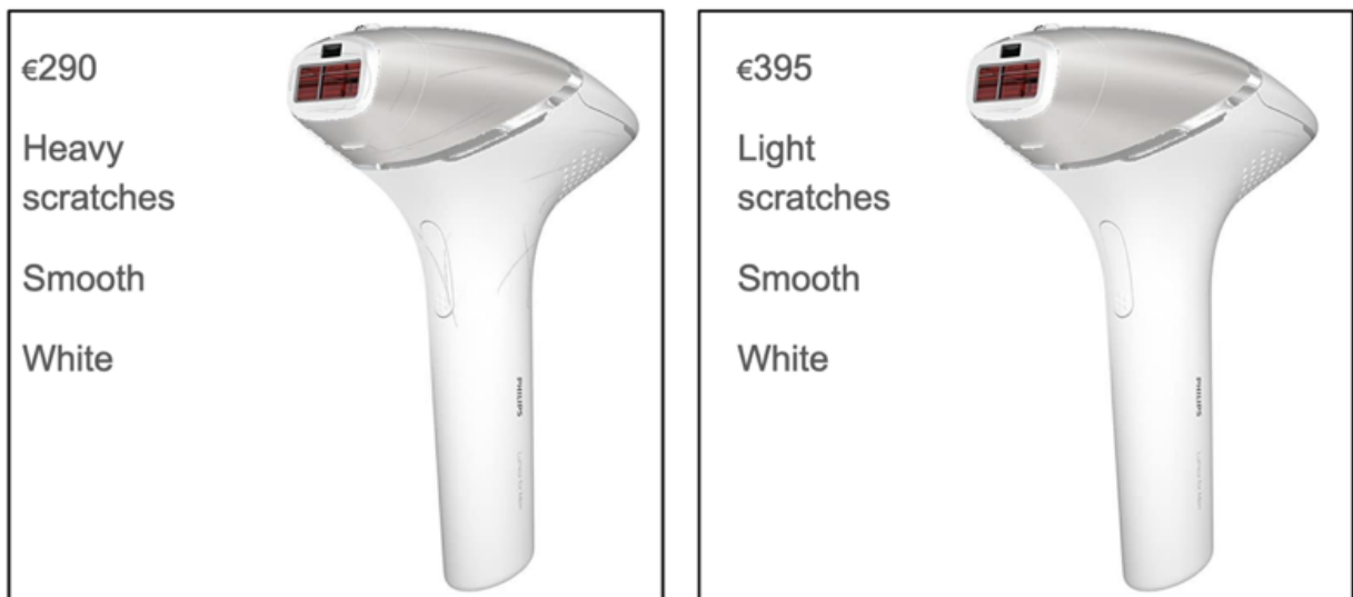
Figure 2. Example scenario with a white IPL device with heavy wear-and-tear (left) and one with light wear-and-tear (right)

The participants were first interviewed on their general choice for the IPL device and why they chose it in a new, second-hand or refurbished. Furthermore, product state of the IPL device (e.g. “Can you describe the condition of the product at its arrival?”), the first product use (“Can you describe your first use experience?”), product characteristics (“Can you describe the appearance of the product?”), and why they did or did not choose a refurbished one (e.g. “What made you decide to buy a refurbished device over a new one?”) were discussed. Second, all participants were shown six scenarios consisting of images of two refurbished IPL devices side by side. The two options differed in color (black or white), material (smooth or rubber), amount (light or heavy wear-and-tear) and location of wear-and-tear (on housing or on buttons or attachment) and price (290-450€; for an example, see Figure 2 and for all scenarios Table 2). The images were created in Adobe photoshop and were used to stimulate the imagination of buying a refurbished Lumea with different features. We explained that these products were refurbished, after which participants were asked which one, they would buy and to explain why. Participants received a small compensation (10 euros voucher) for their participation in the 30-40 minutes long study. The study was approved by the Human Research Ethics Committee of the Delft University of Technology.