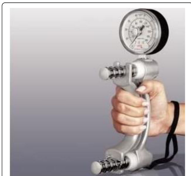
Fig. 1 Jamar hydraulic dynamometer (Model 5030 J1, Sammons Preston Rolyan, Bolingbrook, IL, USA)

Statistical analysis was performed by SPSS 23 (IBM Corporation, New York, NY, United States). The normality test was carried out using the Kolmogorov-Smirnov test and confirmed for all data sets. Statistical outliers were checked using Grubb’s test that is based on the difference of the mean of the sample and the most extreme data considering the standard deviation [51]. An independent sample t -test was carried out to determine the HGS differences between boys and girls. Paired t -tests were performed to compare the handgrip strength of the dominant hand vs the non-dominant one. The variations of HGS in various ages were tested by one-way ANOVA with Scheffe’s posthoc contrast. Analysis of covariance (ANCOVAs) was used to determine the effect of age, gender, and age/gender combined on handgrip strength. All assumptions regarding ANCOVAs were checked and upheld before performing data analysis. The values of p < 0.05 were considered statistically significant.