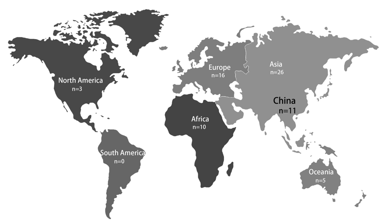
Fig. 1. Geographical distribution of the case studies by continents.

Furthermore, the participation of Chinese businesses reaches almost half of the cases (43 percent), compared to the international cases (18 percent). Businesses play an important role in the profit-driven processes of decision-making in China, which is in line with the government's expectations.