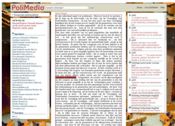
Fig. 3. Screenshot of the PoliMedia debate page