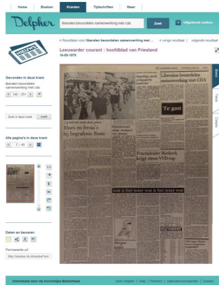
Fig. 4. Screenshot of an example newspaper in original lay-out, containing an article about a parliamentary debate.