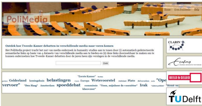
Fig. 1. Screenshot of the PoliMedia home page