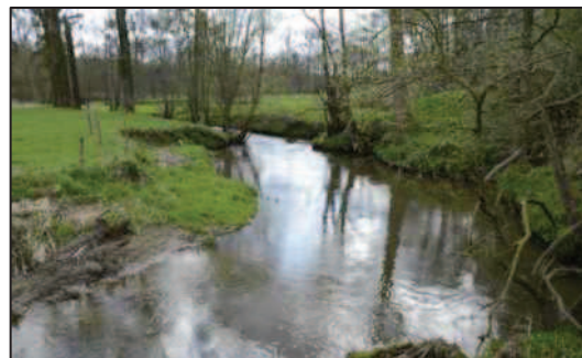
Figure 2 Geul River near the border between The Netherlands and Belgium.

with the Meuse is located near Itteren, the Netherlands, at an elevation of 50 m a.s.l. The river is 56 km long in total and has a longitudinal slope of 0.02 m/m in its upper reach and of 0.0015 m/m in its downstream reach. The basin has a total surface of 380 km 2 with a precipitation of 750-800 mm/year in the area close to the confluence and of 1,000 mm/year, in its upper part (de Moor, 2007).