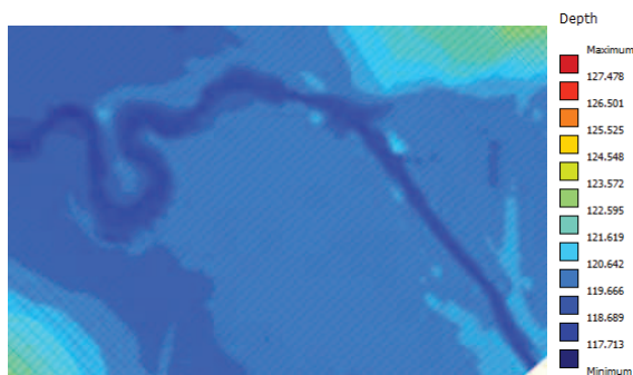
Figure 4 Model grid and elevation near the upstream boundary.

The main channel bed level is about 2.5 m lower than the floodplain level in the upper part of the river and 3.5 m lower in Valkenburg.