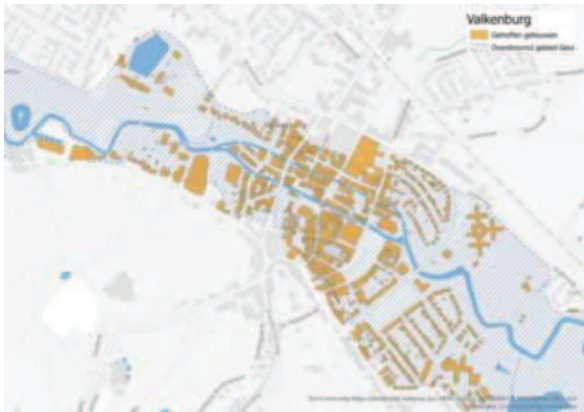
Figure 1 Affected and flooded areas in Valkenburg (Task Force Fact Finding hoogwater 2021 (2021)).

To this purpose, a 2D model was created with Delft3D 4 suite covering the river from the border between The Netherlands and Belgium to Meerssen, close to the confluence with the Meuse.