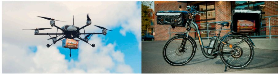
Fig. 3. Example of a fast-food delivery hexa-copter drone, adapted from (Krader, 2019); and a typical fast-food delivery E-bike with an integrated delivery cargo box, adapted from (Toll, 2019).

operate and handle the delivery of hourly meal orders.