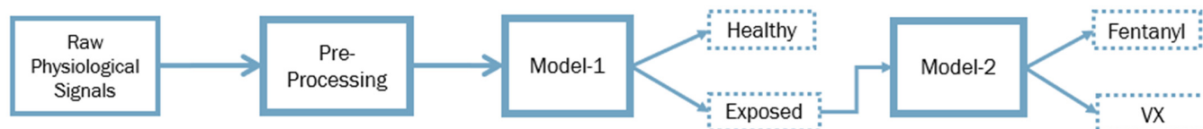
Figure 1. Overview of the study. After pre-processing, Model 1 classifies the samples into either ‘healthy’ or ‘exposed’. Model 2 then classifies ‘exposed’ samples into either ‘fentanyl’ or ‘VX’.

animals, the test set the remaining 20%. Optimization of the parameters was done using cross-validation on the training set, in a repeated random sub-sampling fashion (Monte Carlo). Multiple random splits were made of about 12.5% of the training set as a validation set. This was again done using a stratified variant where each set contained a proportional number of animals from each of the four sets. For each split, the validation data was used to tune the hyperparameters and to decide on the final model parameters. The final model was trained on the whole training set and applied on the independent test set to obtain the final performance score. Table 2 gives an overview of the number of samples and animals involved in the different sets.