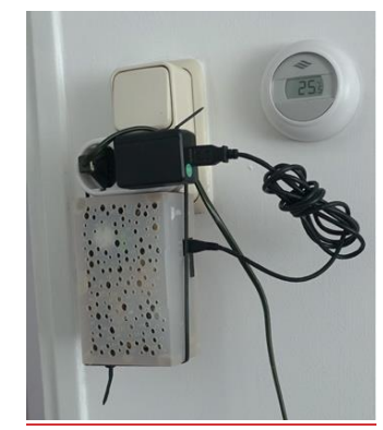
Figure 1: The monitoring boxes installed in the dwellings, developed by industrial partner OfficeVitae.

Each of the ten dwellings was fitted with three monitoring devices [Figure 1]. These sensor boxes record and transmit the measurements for indoor temperature, levels of CO2, and humidity in 3minute intervals. One of the three sensor boxes was placed in the living room, one in the kitchen, and one in the front room. Bedrooms where not monitored because the ethical approval for the study had to be obtained within a short time frame.