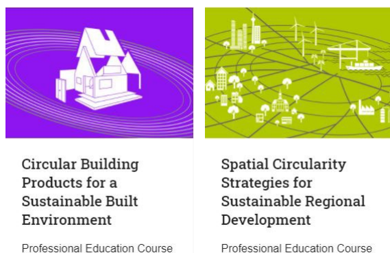
Fig. 2 – There are two Professional Education courses available by the Faculty of Architecture and the Built Environment: the first focuses on the product scale (left) and the second on the regional one (right)

professional cohorts exclusively. Therefore, they are more effective in providing customized frameworks per sector or per industry. CBE Hub is currently running one ProfEd course for the product scale and another one for the regional scale. Whilst the first targets professionals from the building products' industry, the latter focuses more on individuals or groups involved in administration bodies. ProfEd cohorts are designed to be limited in number; thus, learners' exchange is more direct and feedback is more precise and systematic.