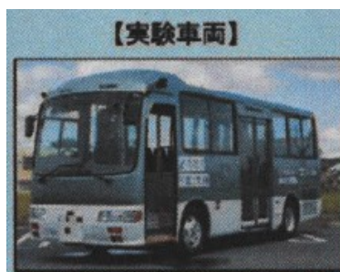
Figure 3: Route of the vehicle & the automated vehicle (14)

There were no warnings displayed in the area to warn other road users of the presence of the automated vehicle. The automated vehicle itself contained several warnings signs on the outside. Also,