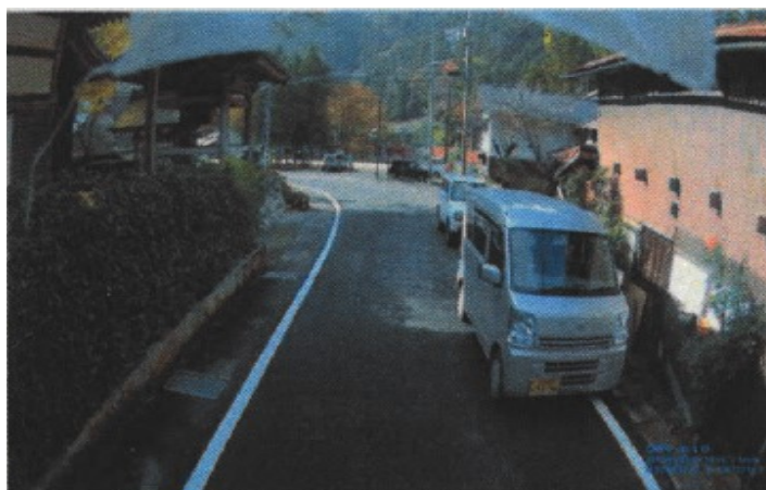
Figure 7: Upcoming traffic (14)

During the experiment, a driver was present in the vehicle. Since a traditional bus was used, a steering wheel and pedals were present in the vehicle. At some parts of the route, the road was narrow; below 5,5 meters wide. The driver had to take over when upcoming traffic was approaching, because the vehicle was not capable to swerve around upcoming traffic. Figure 7 shows the situation with upcoming traffic.