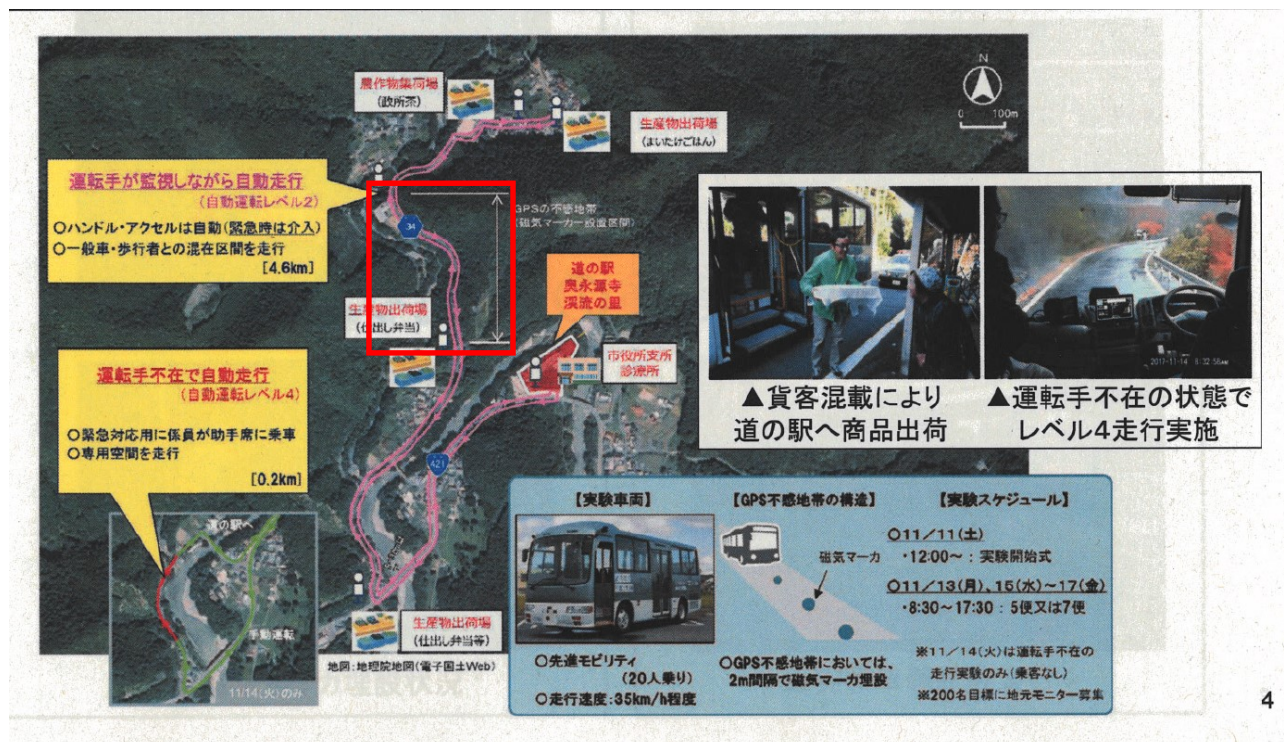
Figure 4: Interrupted GPS area (14)

Most automated vehicles use different technologies to find their way. Digital road maps, Light Image Detecting and Ranging (LIDAR) sensor, laser scanners and GPS are often used (17). However, GPS signal might fail in tunnels or under viaducts. The LIDAR and laser scanners might contribute to the positioning of the vehicle, but the reliability can be insufficient at night or under poor weather conditions (18). The mountains at the Oku-Eigenji area interrupted the GPS signal of the vehicle and therefor magnetic markers were used to help the vehicle localize. The red marked area on figure 5 shows where the signal as interrupted.