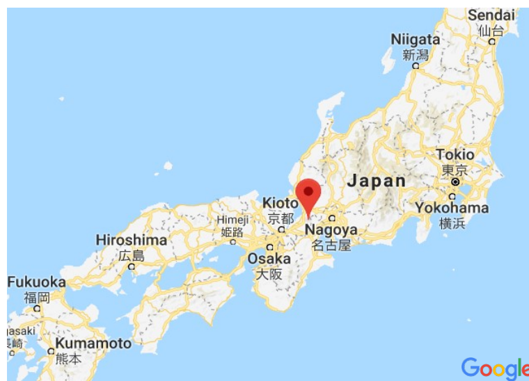
Figure 1: Location of Oku-Eigenseji

The area where the automated bus was operating is called the Oku-Eigenji area. There are approximately 320.000 inhabitants in the area. The Oku-Eigenji area is a mountainous area located in the Shiga prefecture, next to the Kyoto prefecture. See figure 1 for the location.