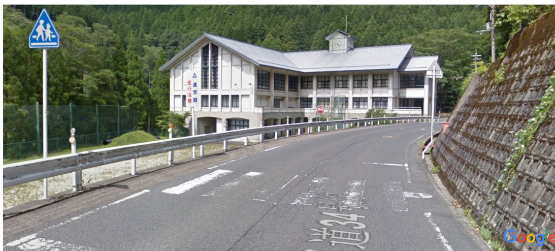
Figure 8: Pedestrian situation

school. A few meters further on the right is a staircase for pedestrians. When pedestrians descend the stairs, they cross the road and continue their travels on the left side of the road.