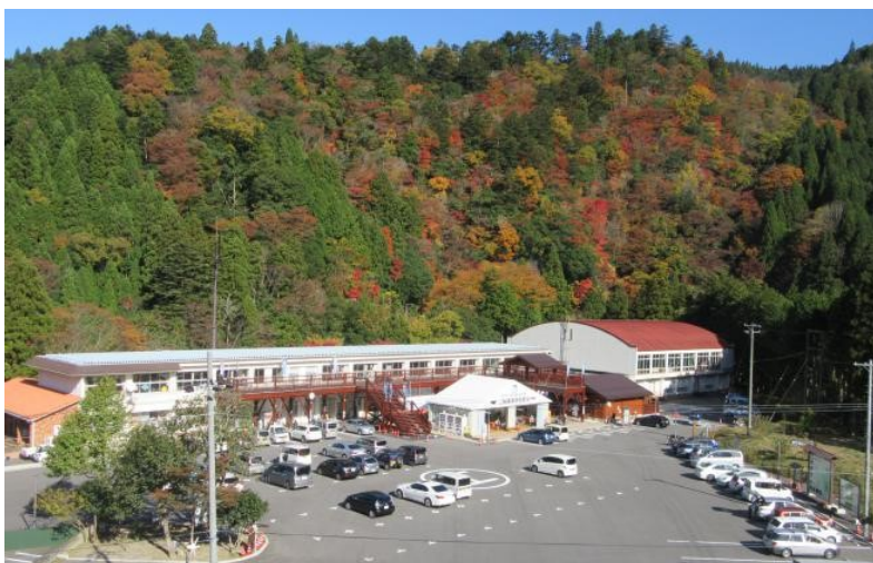
Figure 2: Michi-no-Eki Okueigenji keiryu no sato (10)

The Michi-no-Eki Okueigenji Keiryunosato rest area is designed according to the abovementioned purposes. At this rest area there is a cultural centre, road information, rest area, tourist information and there is a local farmers market. Close to the rest area is a sightseeing point with a lake which attracts tourists. Sometimes the premises are used for local government offices or medical services(9).