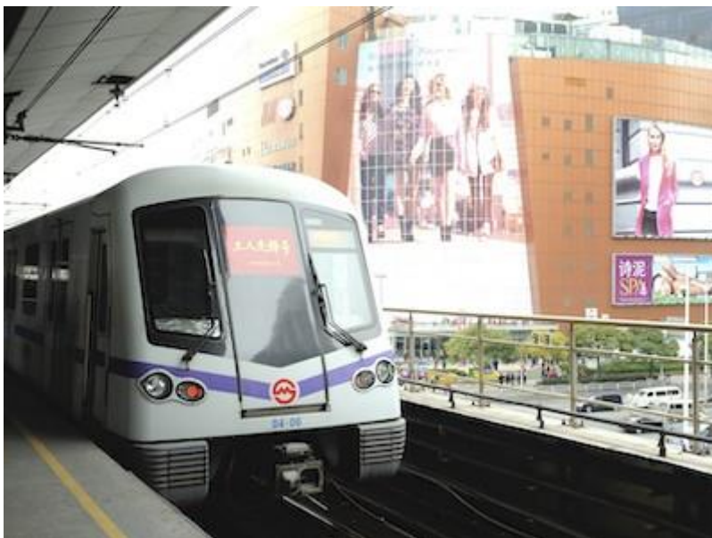
Shanghai's transport infrastructure was significantly boosted in the run-up to Expo 2010, with five new metro lines opening