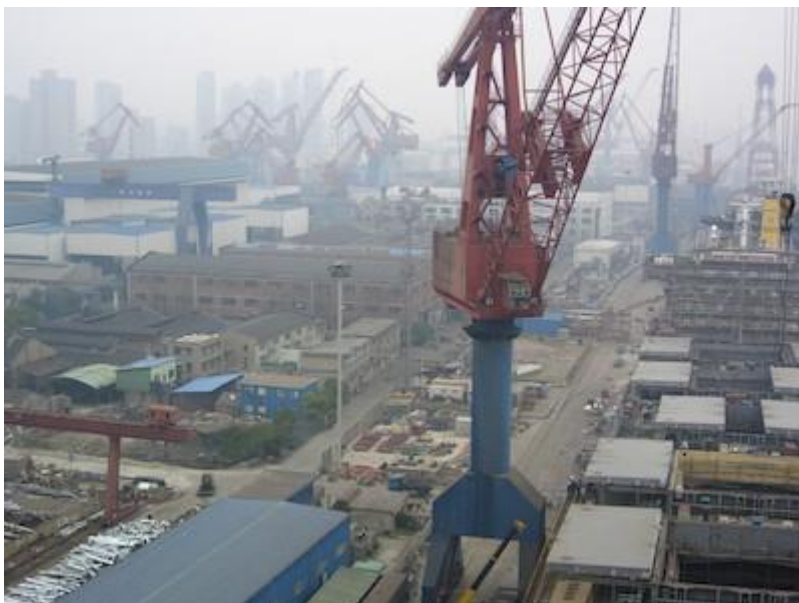
The shipyards on the banks of the Huangpu River in Shanghai, prior to Expo 2010

"Shanghai's World Expo preparations served as a catalyst to facilitate the urban restructuring process"