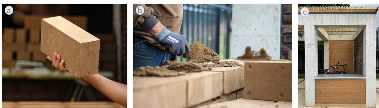
Figure 13. Cow-dung stabilised CEB wall constructed at TU Delft, Netherlands provide evidence of its water resistance characteristics in the rainy weather of Netherlands. (a) Cow-dung stabilised CEB block, (b) Cow-dung stabilised earthen mortar, (c) Cow-dung stabilised CEB wall.

recently [62]. Studies on biological stabilizers have shown promising improvements in strength and water resistance with xanthan gum, gellan gum and agar gum. Stabilizers such as cow-dung, which has been traditionally used in earthen construction, show a significant improve in water resistance, while its effect on compressive strength is insignificant [63]. An example of wall made with cow-dung stabilized blocks is shown in Figure 13. Other traditional stabilizers such as tannins and casein have also shown their potential in improving the water resistance of earthen materials. Starch is one of the stabilizers that has a potential to improve water resistance and strength by heating it at elevated temperature. However, it should be noted that the improvement noted through biological stabilizers are less compared to cement or lime stabilized earthen blocks. Their application is also limited by the high cost of these stabilizers. However, stabilizers that can be extracted from waste such as cow-dung, starch and casein can be cost effective and enhance performance to a desired level.