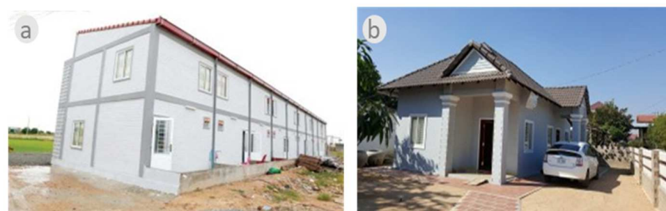
Figure 9. Housing solutions with ISSB in Cambodia: (a): row houses in two floors built with ISSB; (b) individual house built with ISSB, by My Dream Home, Cambodia.

Kongngy Hav is a social entrepreneur from Phnom Penh, Cambodia, and he has developed ‘My Dream Home’, a concept designed to provide affordable quality green housing to those who cannot afford to buy traditional housing in Cambodia (Figure 9). It utilizes an interlocking brick system, designed to provide sturdy construction that can be put together by people without building skills. Through the initiative, an average small two-storied home can be built for between USD 4000 and USD 6000, including design and technical assistance on the construction site. According to the entrepreneur, a dwelling would take two low-skilled people just a couple of months to build. Furthermore, it is claimed that these houses are 20–40 per cent cheaper than traditional housing, less labour intensive and better for the environment, with consideration about location, safety and access to utilities and clean water. The ISSB blocks are ecological and uses minimal cement. They are also aesthetically appealing when used in modern building [56].