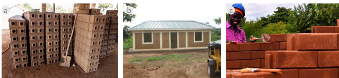
Figure 4. Earth bricks used in Uganda: (a) storage of CSEB in Jinja (‘Tanzania’ Brick); (b) house built with ISSB of Hydraform; (c) house under construction with Hydraform ISSB.

In Uganda, UN-Habitat was involved in several housing projects realized with CSEB, such as schools, health centres, toilet blocks and housing [31]. Nambatya [7] studied Interlocking Stabilized Soil Blocks (ISSB) technology in Uganda, where cement was added to soil and compressed. Nambatya stated that ISSB is an environmentally friendly alternative and technically superior to fired bricks. ISSBs are more cost-effective per square meter with up to 40% cost savings accruing from dry stacking and less mortar for plastering and rendering. ISSB block presses are widely available in Uganda, with Makiga and Hydraform as local suppliers. Hydraform realized various affordable housing projects in Uganda with the help of NGOs, social enterprises and commercial enterprises [32]. HYT Uganda has built affordable housing for child-headed families (without parents), community centres and water tanks, among other things [33]. Both Hydraform and HYT use the interlocking stabilized soil block (ISSB) in Uganda, as shown in Figure 4.