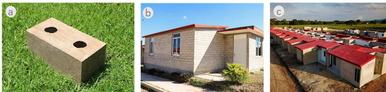
Figure 11. CSEB and housing in Mexico; (a) used CSEB, (b) built house, (c) realised Echale neighbourhood.