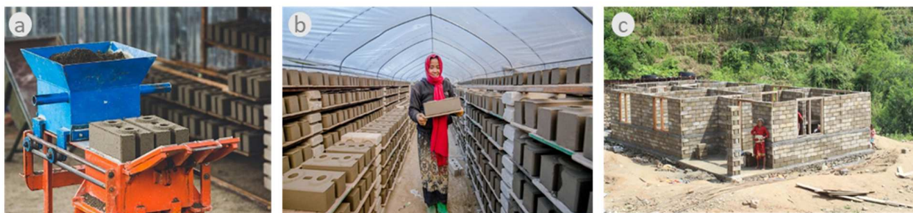
Figure 10. CSEB in Nepal; (a) compression press and ISSB, (b) curing of ISSB, (c) construction with ISSB.

small companies have emerged to produce building blocks in the form of CSEB or ISSB from local raw materials using manually operated press. Central Nepal was hit by two earthquakes in 2015, where more than 9000 people were killed and 800,000 dwellings were destroyed. There, more than 3500 homes were built in the remote rural areas, while 200 micro-businesses were established, creating 2200 jobs. Roughly half of all masons trained in the construction of CSEB homes are from deprived groups and almost a third are women [57]. Many other houses with CSEB interlocking bricks were (re)built by Build-up-Nepal Engineering, together with empowering rural entrepreneurs and communities to build safe, affordable homes and resilient incomes. ISSB stabilized with cement (10%) were used to build earthquake resistant structures [5]. Example for the use of CSEB in Nepal is shown in Figure 10.