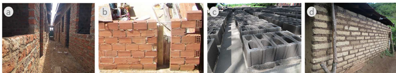
Figure 1. Mainstream building materials for walls used for low-cost housing: (a) fired brick wall in Uganda; (b) wall of hollow terracotta bricks in Brazil; (c) hollow concrete blocks for housing in Nicaragua; (d) wall of adobe blocks in El Salvador.

Production of traditional fired bricks made out of clay have negative effects on the climate. Firing produces smoke and smog—if conducted in or near the cities— and causes extreme carbon dioxide emissions [11]. If fired with wood, it causes deforestation. The bricks' quality is not always constant and this leads to low quality bricks and inefficiency in the use of raw materials and mortar. Good quality bricks can be durable and are often used, also for stacked construction.