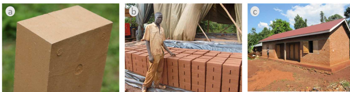
Figure 5. Earth blocks in Uganda: (a) rectangular earthen building block, (b) storage of CSEB, (c) houses built with CSEB.