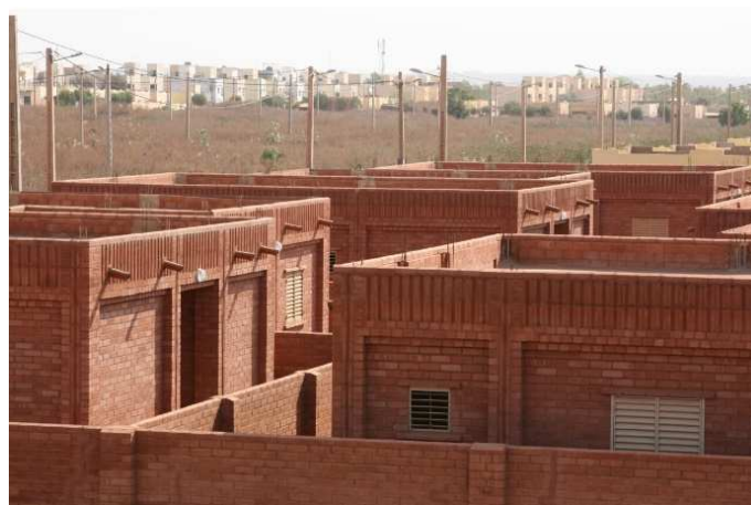
Figure 6. Social housing project in Bamako, Mali.

In West-African countries the climate is dry and landscape circumstances differ very much from the tropical region of Central Africa. In Mali, an example of earthen building blocks can be found in a project of 300 houses in Bamako, commissioned by the Ministry of Urban Development and Housing (Figure 6). Building blocks are produced with a mobile installation that manufactures hydraulically compressed earthen blocks (called HCEB). The building blocks are rectangular earthen bricks that are built with mortar of only 0.5 cm. In these blocks, cement was not used, which is feasible in the dry climate. However, for the load-bearing walls, a small percentage of lime was used as a stabilizer. The Dutch enterprise Oskam-vf. supplied the technology and the machines for this and other projects in Africa. Its partners LEVS Architects from Amsterdam and TNO are conducting research on cementless compressed earthen building blocks. Research on local resources in Senegal has shown that local and cheap (waste) resources are available to make a 100% locally cementless compressed earth block [38]. Other construction projects carried out with the same building blocks are a practical training college in Sangha, Mali, a community centre in Wadouba and two schools in different villages, all in Mali [39]. A description of modern building with earth in Africa is given by [40].