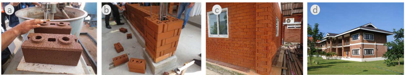
Figure 8. Housing solution with ISSB in Thailand: (a) ISSB of TISTR Thailand; (b,c) wall building with ISSB; (d) model house built with ISSB.

‘green’ building technology. The involvement of local households and communities is a social sustainability goal, that is reached by the promotion of the use of ISSBs and the transference of knowledge and equipment to local communities and small businesses. The ISSB building blocks are most conveniently used for low-rise in one or two storeyed houses. Many other buildings such as schools, community centres, hotels, industrial buildings and private housing can be realized with the ISSB. Having one’s own home is vital for many families in Thailand. The modest housing type is model Style a 1, with 45 m 2 floor space. The houses built with the first generation ISSBs—already a period of around 35 years—still have a good quality [54,55]. Some of the housing solution with ISSB in Thailand is shown in Figure 8.