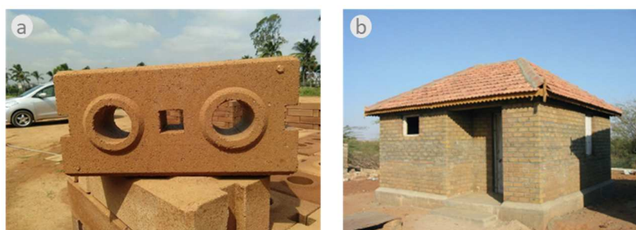
Figure 7. (a) Contemporary CSEB used in Gujarat; (b) wall with CSEB built for housing in Gujarat (2002).

In 2001, a massive earthquake devastated huge areas of the district of Kutch in the state of Gujarat. Rehabilitation was planned by the government and NGOs realized its aid programs for housing reconstruction. For example, the Catholic Relief Services assisted on several rehabilitation programs and built 2698 houses of various types in 39 villages (Figure 7). They produced about 8 million hollow interlocking blocks for earthquake resistance and trained/employed more than 2000 people. The technology with hollow interlocking blocks (called CSEB then) was developed by Auroville Earth Institute and approved by the Gujarat State Government. The average wet compressive strength achieved with local soil and 8–9% cement was around 50 KG/cm 2 (5 MPa) [42].