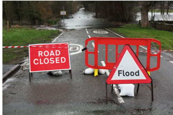
Fig. 4.3 Flood warnings in England

recession. There has also been resistance where there is a strong urbanist or architectural tradition in planning, and where more neo-liberal attitudes prevail. Nevertheless, there is evidence that the notion of 'the spatial planning approach' has been influential. By the late 2010s, cross-fertilisation was more intensive, not just information sharing among sectors, but involving active cooperation and sometimes coordination of policy (Nadin et al. 2018). Improvements have been gained by bolting on ad hoc tools to the planning process, such as impact assessments of policy, requirements for conformity among plans, joint working on data and analysis and ad hoc cooperation platforms. In some countries, the scope of plans and strategies has been widened.