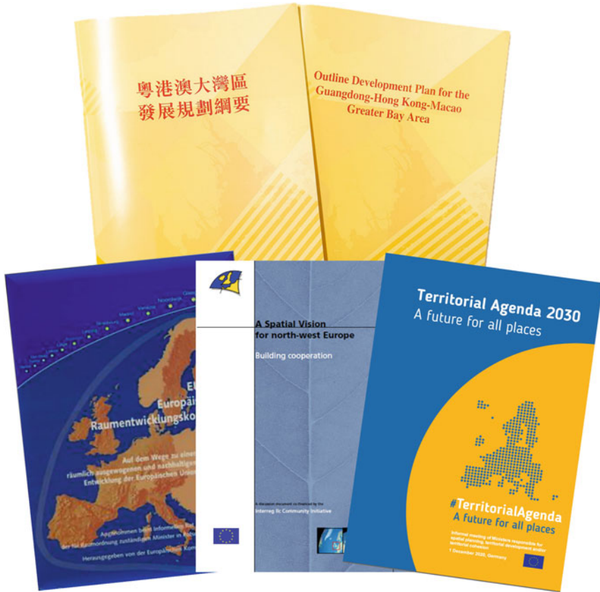
Fig. 4.1 Strategic planning documents in Europe and the Pearl River Delta. Clockwise from top left, outline development plan for the Guangdong-Hong Kong-Macao Greater Bay Area (Chinese version and courtesy translation into English; Greater Bay Area development office, 2019); Territorial agenda 2030 (European Commission 2021a, b); A Spatial Vision for North-west Europe (NWMA 2000); and the European Spatial Development Perspective (CSD 1999) (German edition)

despite various coordinating mechanisms, often pays scant attention to other sectors. Sub-national and local governments also make policy within their jurisdictional compartments—the geographical scope of their power. Their policies will often reflect competition with their neighbouring authorities rather than complementarity. This are a long-standing barrier to effective governance of the territory (European Commission 1998). Policy making in discrete sectors has advantages, it is certainly less costly than seeking coordination, and integration with other sector policies may dilute central objectives (Peters 2018; Candel 2021). It is inevitable that the complex